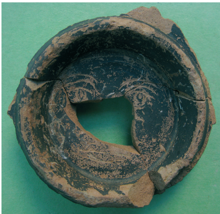
Fig. 3 – Ceramic fragment from Pharos, with the face

2013; 2019a: 66, 67; 2019b: 41, 66.1), while several black glazed/gloss fish plates (and their fragments) come from different sites, including Pharos (Forenbaher et al. 1994: 25, fig. 7, 2; Jeličić Radonić 1995: 110, br. 4; 111; Ugarković 2013: 87, 88; 2019a: 96), where more examples of this pottery type, currently unpublished, have been discovered during recent excavations.