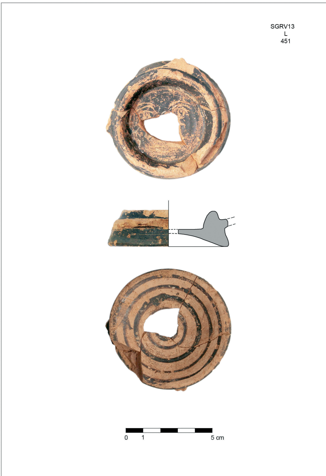
Fig. 2 – Ceramic fragment from Pharos, with the graffito depicting the Gorgoneion (drawing and photo: P. Kukoč)