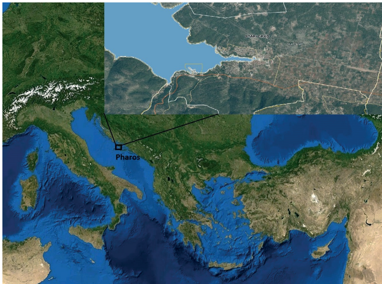
Fig. 1 – Map of the part of the Mediterranean (base map: NASA World Wind (retouched), modified by: Eric Gaba (Sting); close-up base map: Geoportal DGU; made by: M. Ugarković)

In an attempt to unravel some of the unknown facets of Pharian agencies that actively shaped (g)local central Dalmatian cultural practices, which are partly reflected in the preserved material evidence, this paper will focus on the study of a unique ceramic artefact that stands out among hundreds of thousands of recovered Greek pottery fragments, due to its graffito with the depiction of a Gorgoneion.