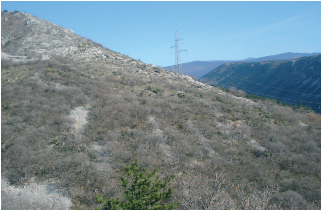
Fig. 1 – Kuk hillfort