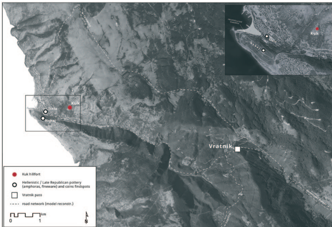
Fig. 7 – Hellenistic/Late Republican pottery and coin findspots in the area of Senj (base: Geoportal DGU, DOF 2021; made by: P. Domines Peter)