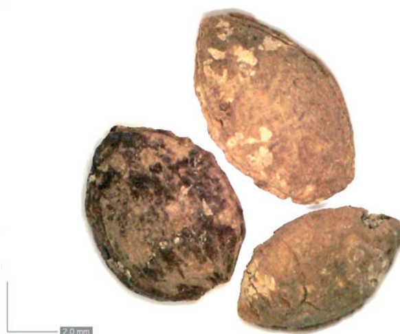
Fig. 6 — Blackthorn ( Prunus spinosa ) fruitstone (left) and two cherry plum/plum ( Prunus cerasifera/domestica s. l.) fruitstones (right)

In the medieval period, fruit was consumed fresh or in the form of fruit products such as juices, concentrates, syrups, jams, jellies, compotes, candied and dried fruit (Renfrew 1973). Given the seasonality in an area with a moderately warm humid climate with warm summers (Cfb climate type according to Köppen's climate types), and