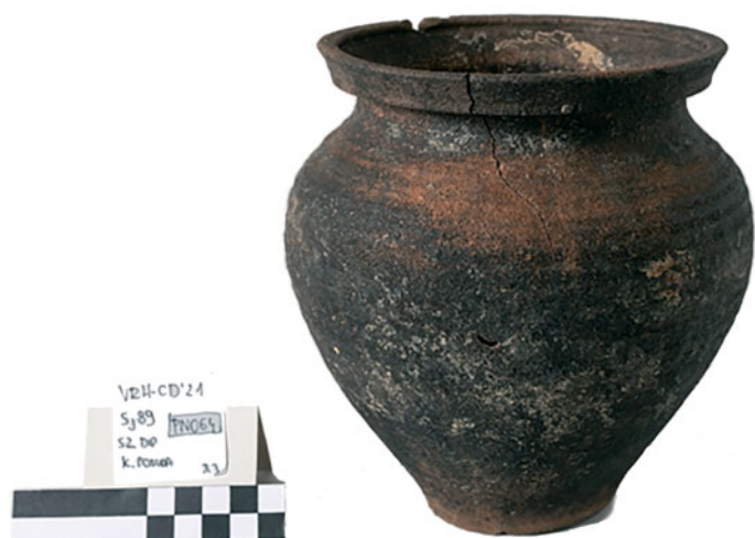
Fig. 4 — Medieval vessel (SF 064) from the fill of the excavated structure

Sl. 4 — Srednjovjekovni lonac (PN 064) iz zapune istraženog objekta