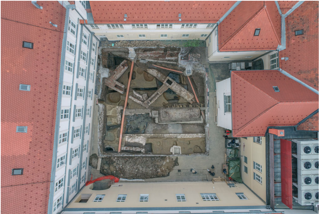
Fig. 1 — Aerial view of the northern courtyard of Banski dvori after archaeological research Sl. 1 — Pogled iz zraka na sjeverno dvorište Banških dvora nakon arheoloških istraživanja

which is today the seat of the Croatian Government. Precisely on the site of the former Rauch Palace, in the northern part of the architectural complex of Banski Dvori Palace, archaeological research has confirmed the continuity of settlement of the Zagreb upper-town plateau from prehistoric times to the present.