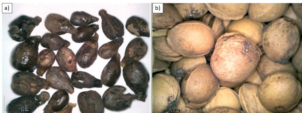
Fig. 5 — Seeds of a) grapevine ( Vitis vinifera ) and b) sweet/sour cherries ( Prunus avium/cerasus ) Sl. 5 — Sjemenke a) vinove loze ( Vitis vinifera ) i b) trešnje/višnje ( Prunus avium/cerasus )

Ukupno je determinirano 11 vrsta, jedan je nalaz determiniran do nivoa roda ( Ranunculus sp.), a jedan do nivoa porodice (Apiaceae). Pet je svojiti u tab. 1 prikazano na način da su ostaci identificirani kao mogući predstavnici dvije različite vrste, tj. roda. Takvi su nalazi označeni na način da su napisane obje moguće vrste, tj. roda kojima bi nalazi mogli pripadati te su ti nazivi međusobno odvojeni kosom crtom (/); Malus/Pyrus , Prunus avium/cerasus , Prunus cerasifera/domestica s. l. (sl. 6), Triticum aestivum/durum i Vitis vinifera/Vitis vinifera ssp. sylvestris . U nabrojanim slučajevima nije bilo moguće na osnovu izgleda pronađenih sjemenki sa sigurnošću odrediti o kojoj se točno vrsti radi. No, kako se u svim slučajevima obje vrste ili roda konzumiraju na isti način, determinacija do ovog stupnja bit će također vrlo korisna za rekonstrukciju prehrambenih navika stanovnika srednjovjekovnog zagrebačkog Gradeca.