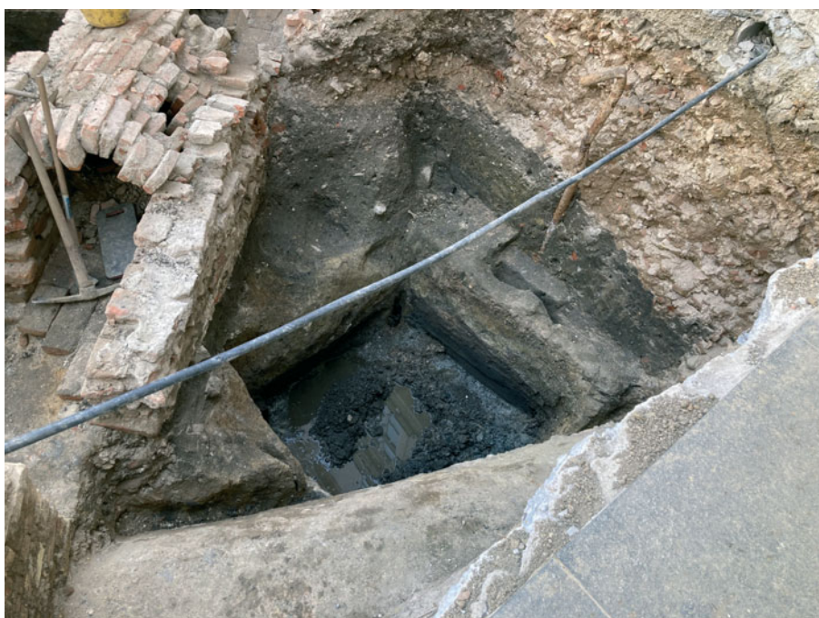
Fig. 2 — Structure during archaeological research, possibly underground storage room

Kontekst iz kojeg su prikupljeni do sada analizirani uzorci je raznolik, no generalno se može reći da su na dosadašnjim lokalitetima dominantni nalazi žitarica. Nalazi obične pšenice ( Triticum aestivum/durum ) i prosa ( Panicum miliaceum ) su najbrojniji i prisutni na preko 80 % lokaliteta, ali na raznim lokalitetima postoje i sporadični nalazi raži ( Secale cereale ), zobi ( Avena sativa ), ječma