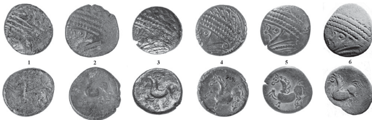
Fig. 3 — Coins of the Kuzelin A type: 1–2 Kuzelin (1 MPS 4184, photo by: I. Krajcar; 2 MPS 8338, photo by: I. Krajcar; with permission of the MPS); 3 Zagreb Upper Town (MGZ 499 A, photo by: M. Gregl; with permission of the MGZ); 4 AMZ A919 (photo by: I. Krajcar); 5 Obljaj (private collection, photo by: V. Kramberger; Cesarik, Kramberger 2018: 139, no. 44); 6 Gradina at Bruvno (private collection, photo by: M. Ilkić, reproduced with permission)

kao „izvorni“ tauriščanski novac (potvrđen u velikim ostavama, a sadržavao je veći udio srebra). Kako je metalurška analiza izvršena na samo jednoj kovanici ovog tipa (AMZ A919: Cu 72 %, Ag 5,5 %, Sn 5,5 %), bilo bi brzopleto izvlačiti generalizirane zaključke iz očito nedostatnih podataka, ali provizorno se može tvrditi da su sve poznate kovanice ovog tipa bile načinjene od slitine bakra s manjim udjelom srebra. Bez obzira na to, ova pojava mora se razumjeti kao neprekinuti nastavak ranije tradicije proizvodnje kovanica u regiji, potvrđene u razdobljima Lt C2 i/ili Lt C2/D1.