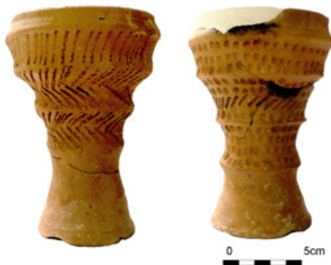
Fig. 3: Ceramic cups with stamped motifs from Veliki Tabor Castle, medieval County of Zagorje (after Škiljan 2012, 137).