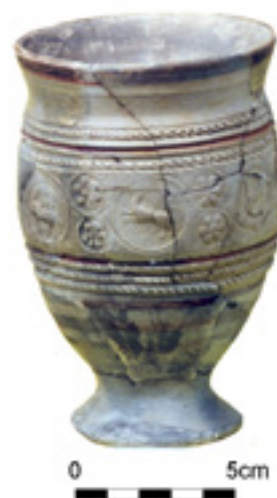
Fig. 5: Ceramic cup with biblical motifs from Sokolovac fortification.