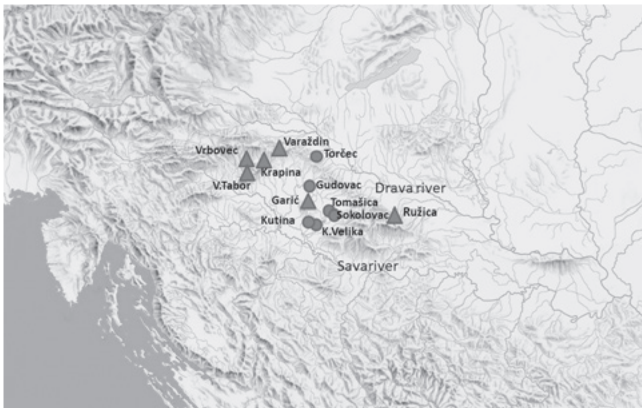
Fig. 1: Castles and small castles in mediaeval Slavonia (Northern Croatia) mentioned in the text: triangle - castle, circle - small castle (lowland hillfort, motte).

The discussion commences with the thesis that a richer nobleman tried to surround himself with rare and more precious objects. The question arises whether such material can shed a light on his social status. Here we need to examine not only unique, precious items of tableware reflecting the status of his peers and - in particular - of those representing a higher social rank, but also the objects which he chose and ordered at a local workshop, expressing his specific needs, desires and world-view. Another interesting point is to determine