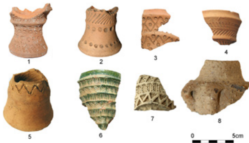
Fig. 2: Vrbovec Castle, medieval County of Zagorje: 1-7. selection of ceramic cups with stamped motifs, 8. Loštice beakers.