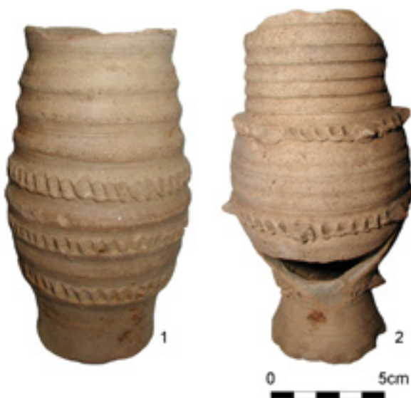
Fig. 4: Ceramic cups from Gudovac-Gradina fortification, medieval County of Križevci.