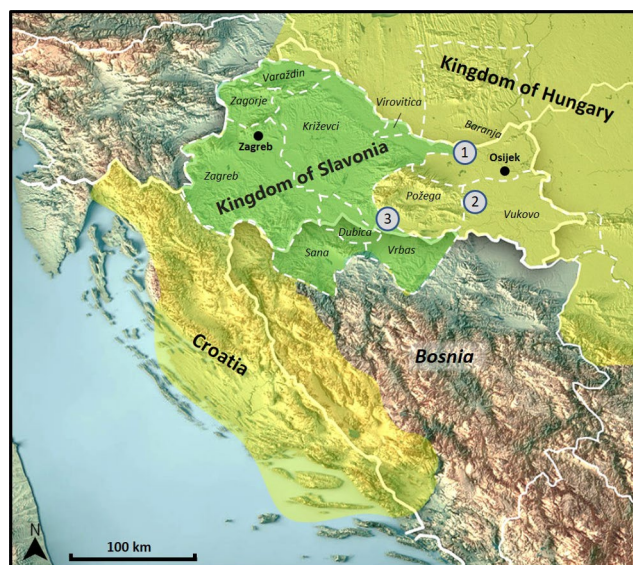
Fig. 2 Map showing the Kingdoms of Hungary and of Slavonia ( Regnum Sclavoniae ) in the middle of the 14th century and divisions of Slavonia into zupanija (regions) (adapted from Regan 2003, pp 143–144, map 90–91)

Slavonia became incorporated within Croatia (present-day central Croatia) (Andrić 2001, pp. 60–61).