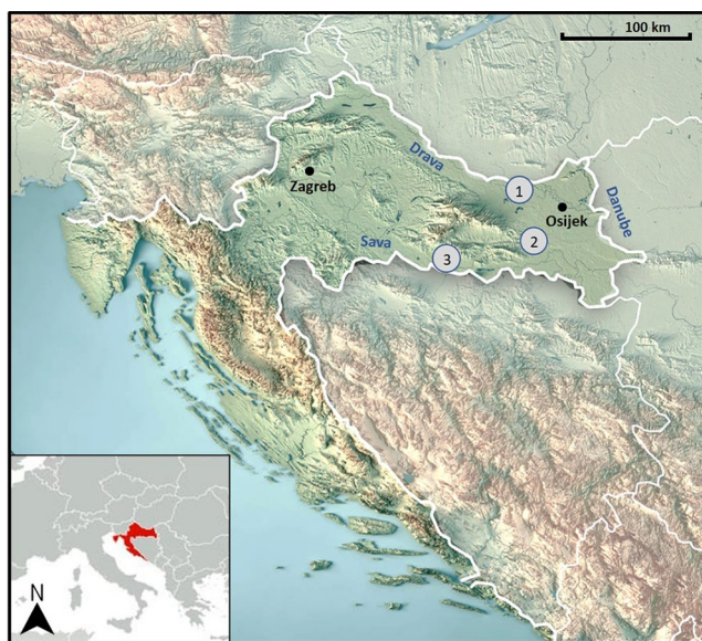
Fig. 1 Location of the medieval settlements; 1, Donji Miholjac-Đanovci (DM-D); 2, Đakovo-Franjevac (D-F), Tomašanci-Palača (T-P), Pajtenica-elike Livade (P-VL), Jurjevac-Stara Vodenica (J-SV), Ivandvor-Šuma Gaj (I-SG), Ivanovci Gorjanski-Palanka (IG-P); 3, Bijela Stijena, Rašaška, Sv. Ivan Trnava (adapted from Ramsrott 2017)

Today Slavonia is located in the eastern part of northern (continental) Croatia (Fig. 1). However, in the Late Middle Ages, the name Slavonia referred to the western part of continental Croatia, an area that lies between the rivers Sava, Drava, Sutla and Dunav (Danube) and included some parts of modern northern Bosnia and Hercegovina (Fig. 2). The eastern part of continental Croatia has no clear historical data but would have come under the jurisdiction of the Kingdom of Hungary. During the 16th and 17th centuries the area of Slavonia moved further east to form present-day Slavonia as it has remained. At that time, the region of old medieval