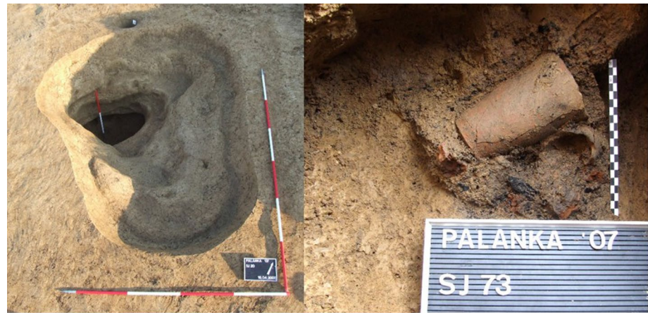
Fig. 4 Excavation of the pit at Ivanovci Gorjanski–Palanka (IG–P) and a closer view of context SJ73, where sample 31 was collected; (image by J. Balen)

context. Thus, the plant remains from D–F, I–SG, J–SV, P–VL, T–P and Bijela Stijena probably represent settlement scatter that has been moved around the site before being deposited in the context from which it was recovered. The fact that many of the sites are multi-period also means that caution should be attached to unusual or singular finds of particular taxa, as they could have been moved from prehistoric to medieval contexts (Pelling et al. 2015). The results will therefore be discussed based on cumulative evidence rather than on a site-by-site basis.