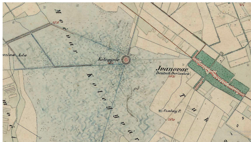
Figure 14. Ivanovac-Korođvar, the First Military survey of the Habsburg Empire (1763–1787).

1 is a northern single enclosure. The dimensions are 158 m × 202 m, covering an area of 2.5 ha, and the ditch is 10 m wide. Ivanovac-Korođvar 2 is a central single enclosure. The dimensions are 214 m × 211 m, and the ditch is 14 m wide. The area of the enclosure is 3.2 ha. On the eastern side, it was damaged with enclosure no 3. Ivanovac-Korođvar 3 is an eastern single enclosure (Figure 17). It is visible on most satellite images from Google Earth, Sentinel-2, etc. (Figures 16 and 18). The dimensions are 147 m × 160 m, the ditch width is 14 m, and it covers an area of 1.8 ha. Ivanovac-Korođvar 4 is a single enclosure. It covers an area of 0.82 ha, its dimensions are 104 m × 106 m, and the ditch width is 3 m. In its southern part, it overlaps with Ivanovac-Korođvar 2. Based on the aerial images alone, it is not possible to conclude which enclosure is older. Ivanovac-Korođvar 5 is a southern single enclosure on the area of 0.2 ha. The dimensions are 53 m × 49 m, and the ditch is 2 m wide [14,20,21].