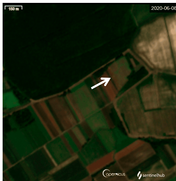
Figure 13. Site Koritna-Pašnik on Sentinel-2 L2A, 8 June 2020. Largest visible enclosure is marked by an arrow. Source: SentinelHub. Contains modified Copernicus Sentinel data 2020 processed by Sentinel Hub. ©Copernicus data 2020.