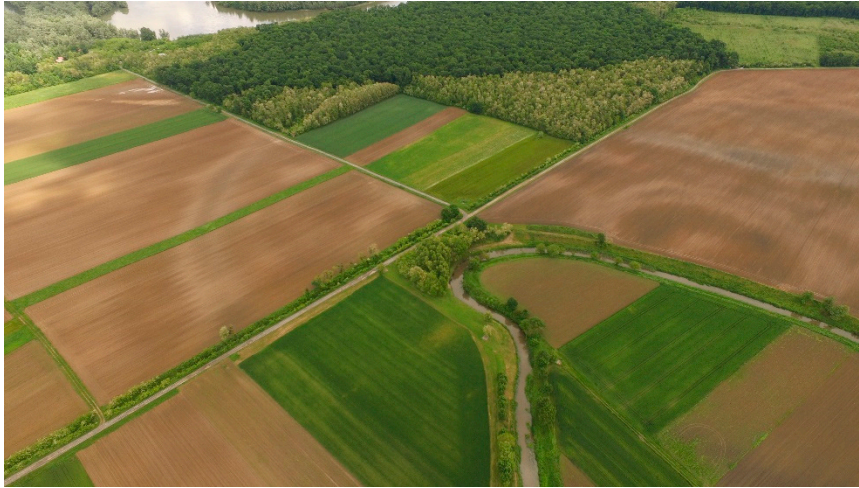
Figure 8. Site of Gat-Svetošnice on drone photography, 16 May 2016, view from the west.