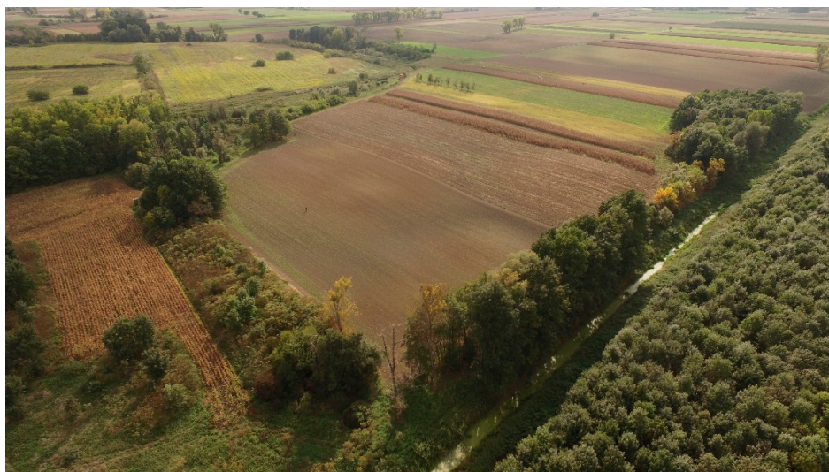
Figure 12. Koritna-Pašnik, drone image (photo: K. Šobat, 6 October 2015).