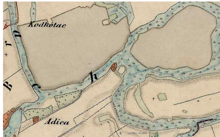
Figure 10. Koritna-Pašnik, the First Military survey of the Habsburg Empire (1763–1787).

enclosure. The visible enclosed area is 0.83 ha. The dimensions are 143 m × 80 m. The ditch width is 5 m. Koritna-Pašnik 4 is a northern single enclosure. The visible enclosed area is 0.15 ha and the visible part of the circle is 80 m with a ditch width of 5 m. Middle parts of the enclosure are 1.3 m to 3.2 m above the surrounding area. Surface finds belong to the Sopot culture. On the image from the First Military Survey of the Habsburg Empire (Figure 10) we can observe two enclosures, most probably enclosure 1 and enclosure 3 [16].