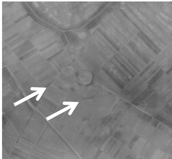
Figure 3. Klisa-Groblje and Brdo, vertical orthophoto image before 15 February 1968. Outer enclosures are marked by arrows and inner are visible as circles.