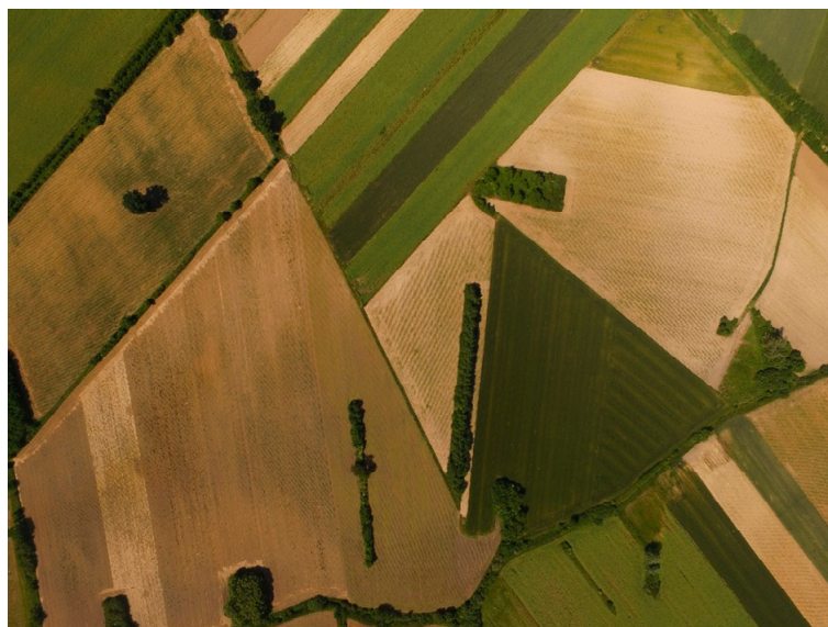
Figure 23. Gorjani-Kremenjača, oblique image from drone (29 May 2015).