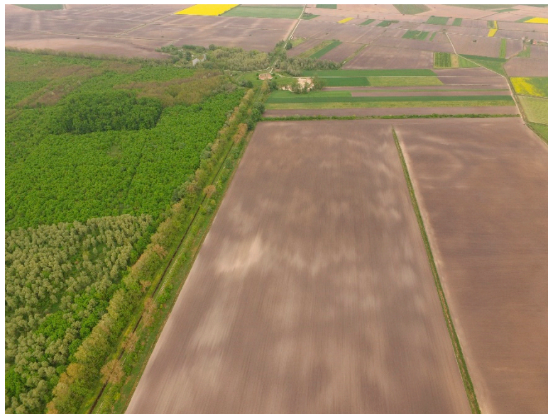
Figure 15. Ivanovac-Korođvar, drone image (photo: K. Šobat, 24 April 2018).