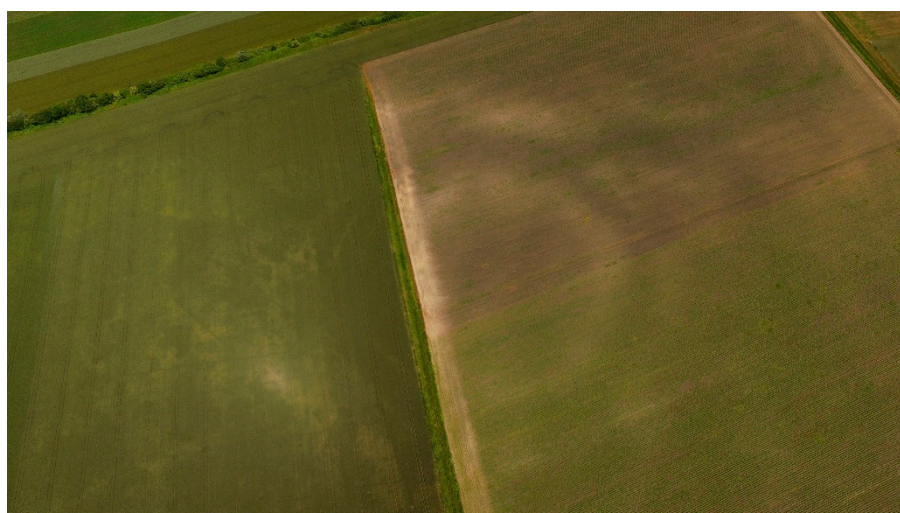
Figure 17. Ivanovac-Korođvar, drone image (1 June 2016).