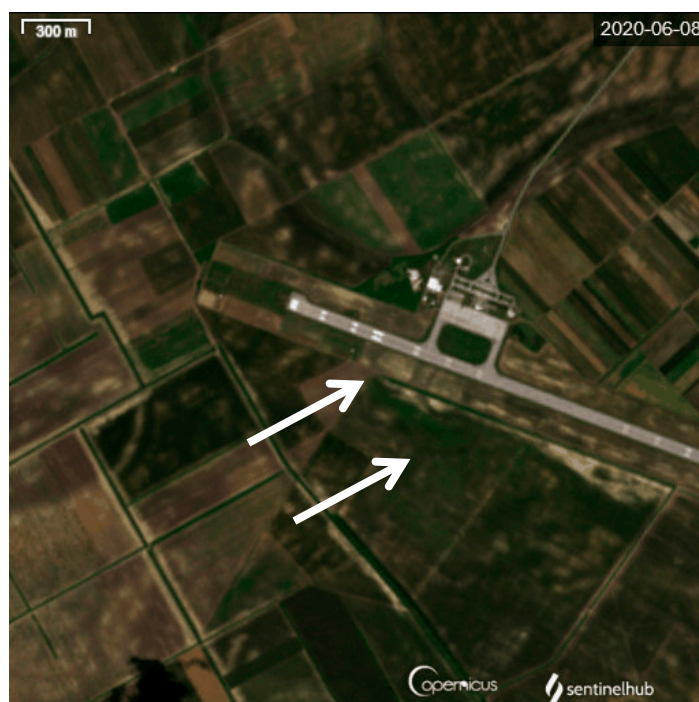
Figure 5. Site of Klisa-Groblje i Brdo on Sentinel-2 L2A, 8 June 2020. Outer enclosures are marked by arrows. Inner enclosures are visible as white colored circles under airport fence. Source: SentinelHub. Contains modified Copernicus Sentinel data 2020 processed by Sentinel Hub. ©Copernicus data 2020.