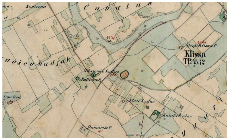
Figure 2. Klisa-Groblje i Brdo, the Second Military survey of the Habsburg Empire (1865–1869).