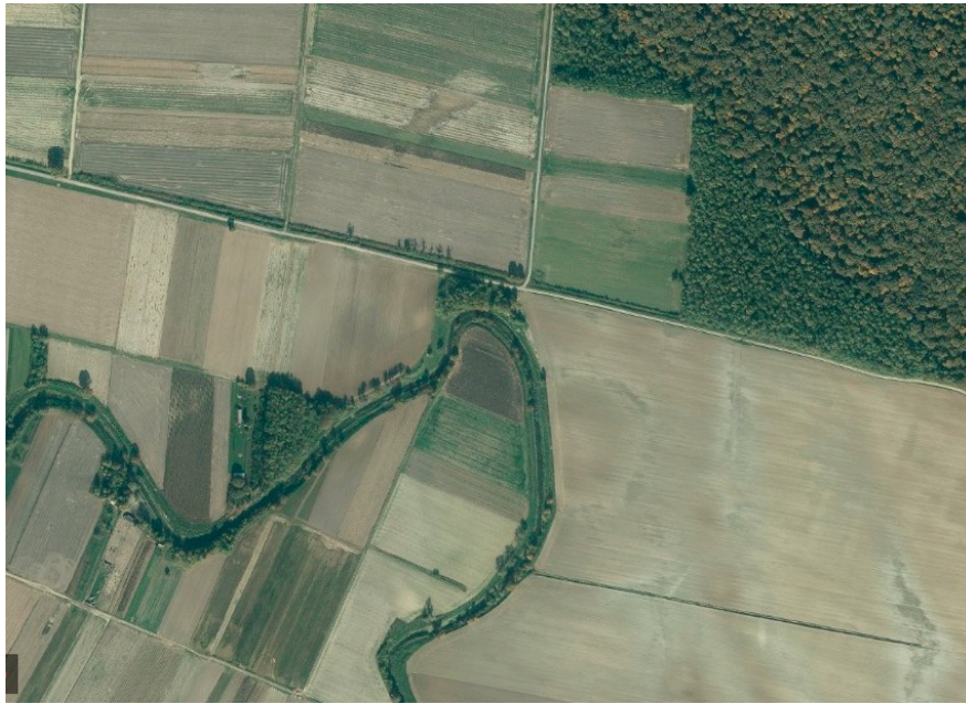
Figure 6. Site of Gat-Svetošnice on the vertical orthophoto image 2017 by Geoportal. Source: Geoportal.dgu.hr.