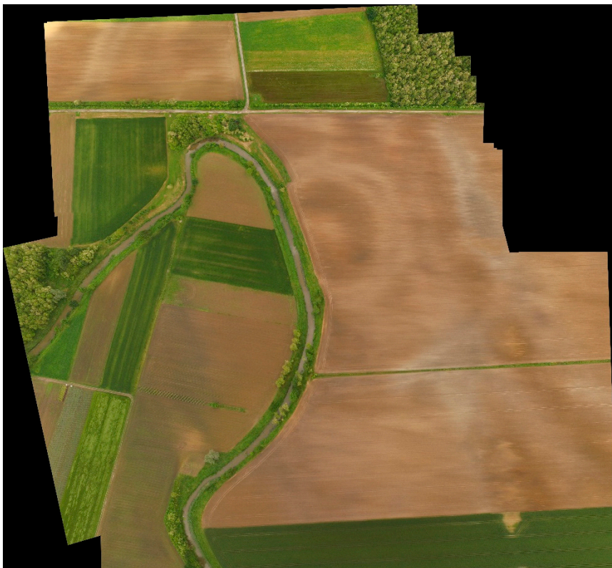
Figure 9. Site of Gat-Svetošnice vertical drone image (photo: K. Šobat, 16 May 2016).