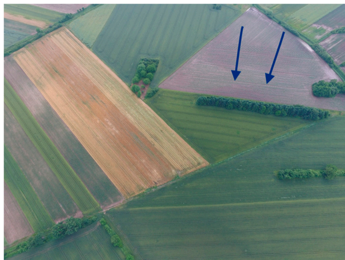
Figure 22. Gorjani-Kremenjača, drone image from 28 May 2018. Shape of the part of the inner enclosure is marked by arrows.