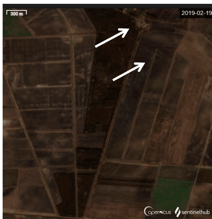
Figure 18. Site of Ivanovac-Korođvar on Sentinel-2 L2A, 19 February 2019. Medieval enclosure is marked by the upper arrow and the Neolithic enclosure is marked by the lower arrow. Source: SentinelHub. Contains modified Copernicus Sentinel data 2019 processed by Sentinel Hub. ©Copernicus data 2019.