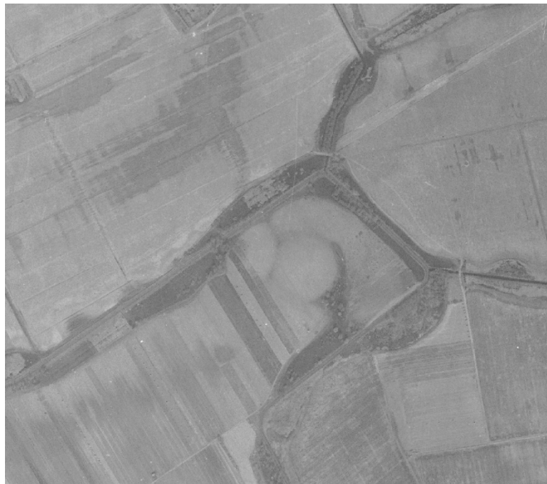
Figure 11. Koritna-Pašnik, vertical orthophoto image before 15 February 1968.