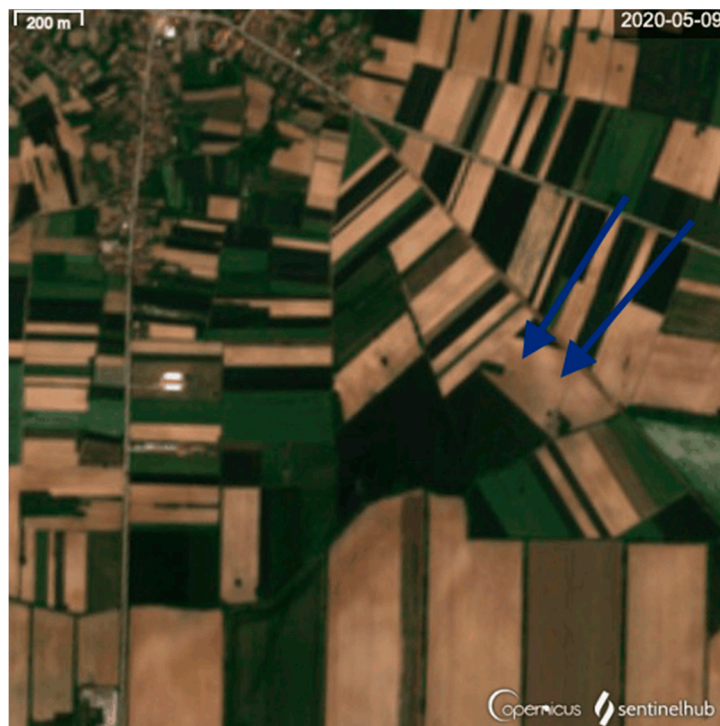
Figure 21. Gorjani-Kremenjača; shape of the part of the most outer enclosure is marked by arrows. Sentinel-2 L2A 9 May 2020.