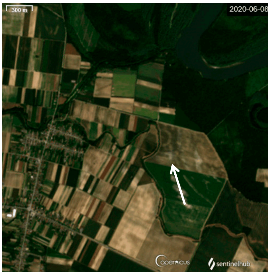
Figure 7. Site Gat-Svetošince on Sentinel-2 L2A, 8 June 2020. Outer enclosure is marked by the arrow. Inner enclosure is visible as a circle. Source: SentinelHub. Contains modified Copernicus Sentinel data 2020 processed by Sentinel Hub. ©Copernicus data 2020.