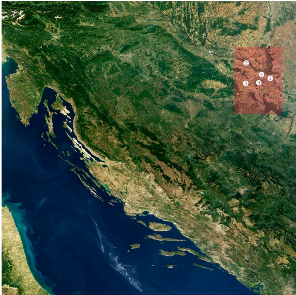
Figure 1. Position of the sites mentioned in the text on a satellite image of Croatia and surrounding areas. ① Klisa-Groblje i Brdo, ② Gat-Svetošince, ③ Koritna-Pašnik, ④ Ivanovac-Korođvar, ⑤ Gorjani-Kremenjača. Satellite image of Croatia in September 2003.