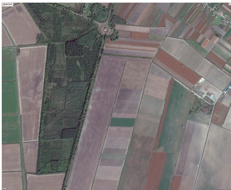
Figure 16. Ivanovac-Korođvar, Google Earth image 24 September 2011 [22].