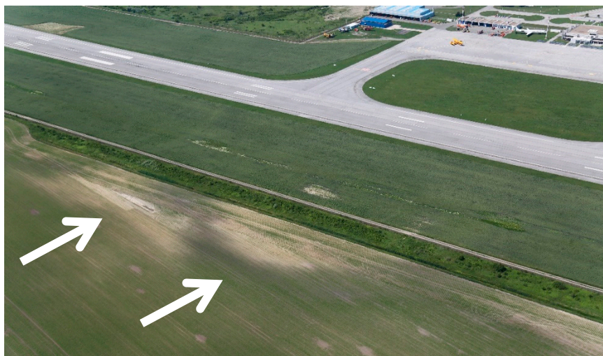
Figure 4. Klisa-Groblje i Brdo, oblique image (photo: H. Kalafatić, 2 June 2015). Inner enclosures under airport runway marked by arrows.