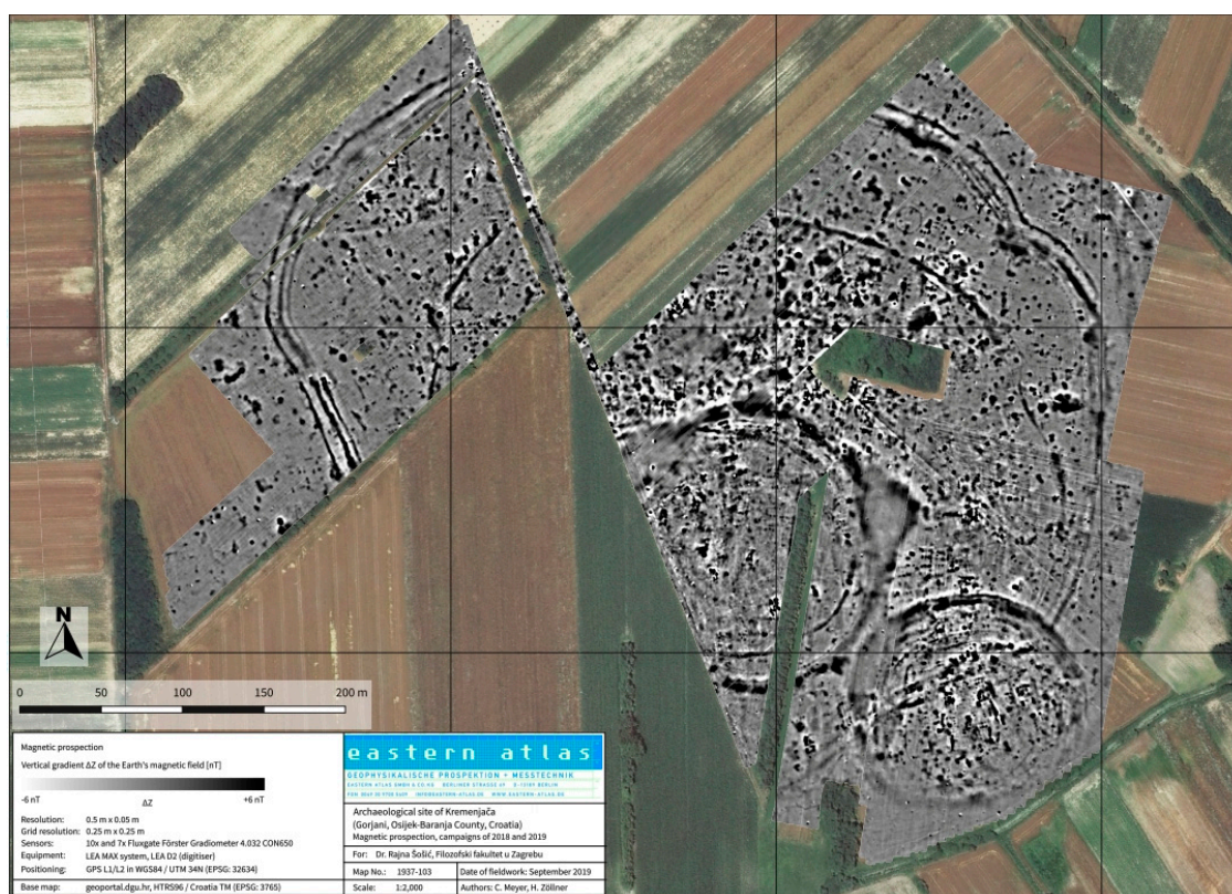
Figure 19. Gorjani-Kremenjača, results of the geomagnetic survey of the site.

This site also belongs to the “twin circle” phenomena (previously defined in [9]) with a surrounding big outer enclosure, similar to Gat and Klisa. Two ditch systems in close proximity to each other, but not overlapping, suggest their simultaneous existence. We can conclude that the smaller circle partly intersects with the outer ditch, suggesting its younger age. It is our future task to define fine chronological details in this settlement’s existence and temporal and architectural changes.