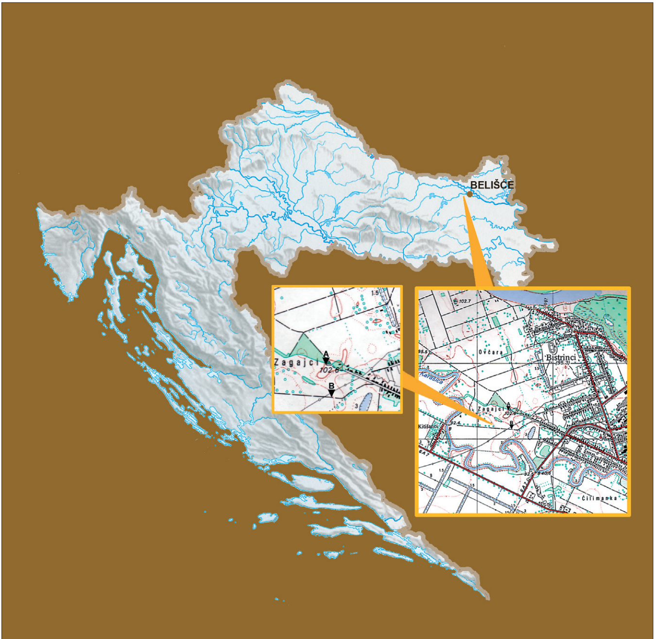
Map 1 Map of Croatia with enlarged details – topographic maps of location of Zagajci near Belišće (Osječko-Baranjska County). Human remains were discovered at spots marked with letters A (a scanty “set”) and B (a single cranium); both below topographic elevations marked with black triangles (created by: Boljunčić and Krajcar).

Karta 1 Karta Hrvatske s uvećanim detaljima – topografskim kartama s položajem nalazišta Zagajci kraj Belišća (Osječko-baranjska županija). Ljudski ostaci otkriveni su na položajima označenima slovima A (oskudni skupni nalaz) i B (pojedinačni nalaz lubanje); oba ispod kota označenih crnim trokutićima (osmislili: J. Boljunčić i I. Krajcar).