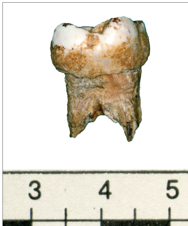
Fig. 3 Polyradicular tooth from Zagajci (buccal side). No inv. no. assigned (photo: I. Krajcar).

DNA analysis included sample preparation, DNA extraction, purification and quantification as well amplification by polymerase chain reaction (PCR) for short tandem repeat loci, using AmpFISTR Profiler™ PCR Amplification Kit. "Ancient" DNA was analysed for nine autosomal short tandem repeat (STR) loci and the amelogenin – sex typing locus.