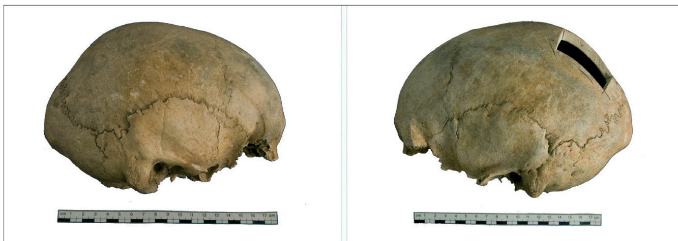
Fig. 1 Lateral aspects of the cranium from Zagajci. The left lateral view (on the right) shows the cranium after taking a bone for DNA sampling. No inv. no. assigned.

Sl. 1 Postranični prikazi lubanje iz Zagajaca. Lijevo postranični prikaz (desno) pokazuje lubanju nakon uzimanja uzorka kosti za analizu DNK. Bez inventarnog broja.