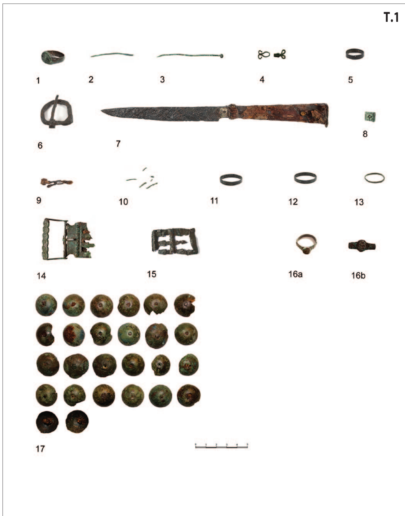
T. 1 Nalazi iz grobova (izradila: K. Turkalj)

Pl. 1 Grave finds (made by: K. Turkalj)