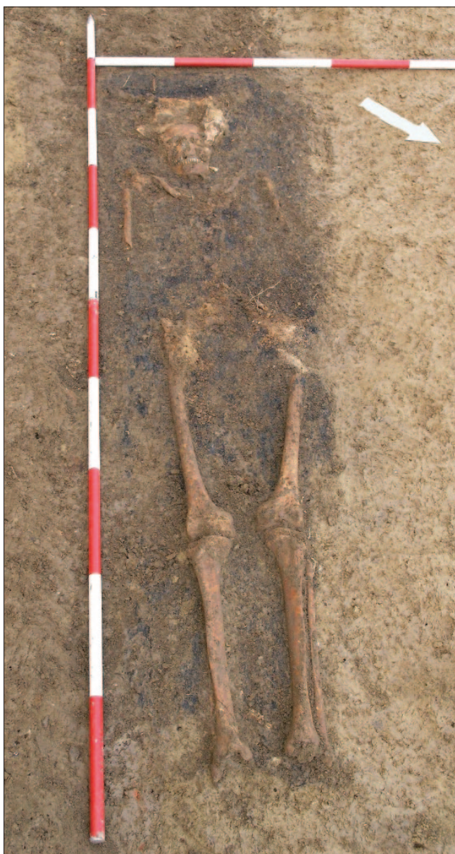
Sl. 2 Ostaci lijesa u grobu 26 Fig. 2 Coffin remains in grave 26

Zbog čestoga oštećenja kostiju pokojnika, položaj barem jedne podlaktice mogao se ustanoviti kod samo 24 ukopa. Podlaktice su najčešće smještene na zdjelici (sedam pokojnika ili 29,2 %), odnosno na trbuhu (šest pokojnika ili 25 %). Po četiri pokojnika imaju ruke ispružene uz tijelo, odnosno jednu podlakticu na trbuhu, a drugu na zdjelici (16,7 %). U po jednome slučaju prisutni su sljedeći položaji: jedna podlaktica na trbuhu, a druga na prsima; jedna podlaktica uz tijelo, a druga na zdjelici; jedna podlaktica na trbuhu, a druga savinuta u laktu i položena na nadlakticu. Kao što je vidljivo, prisutne su različite varijacije položaja podlaktica, no prevladavaju dva položaja: s podlakticama na zdjelici i trbuhu, a to su najčešći položaji i na brojnim drugim kasnosrednjovjekovnim i ranonovovjekovnim grobljima u sjevernoj Hrvatskoj (Krznar, u tisku).