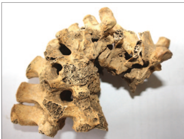
Sl. 5 Pottova grba nastala kao posljedica tuberkuloze