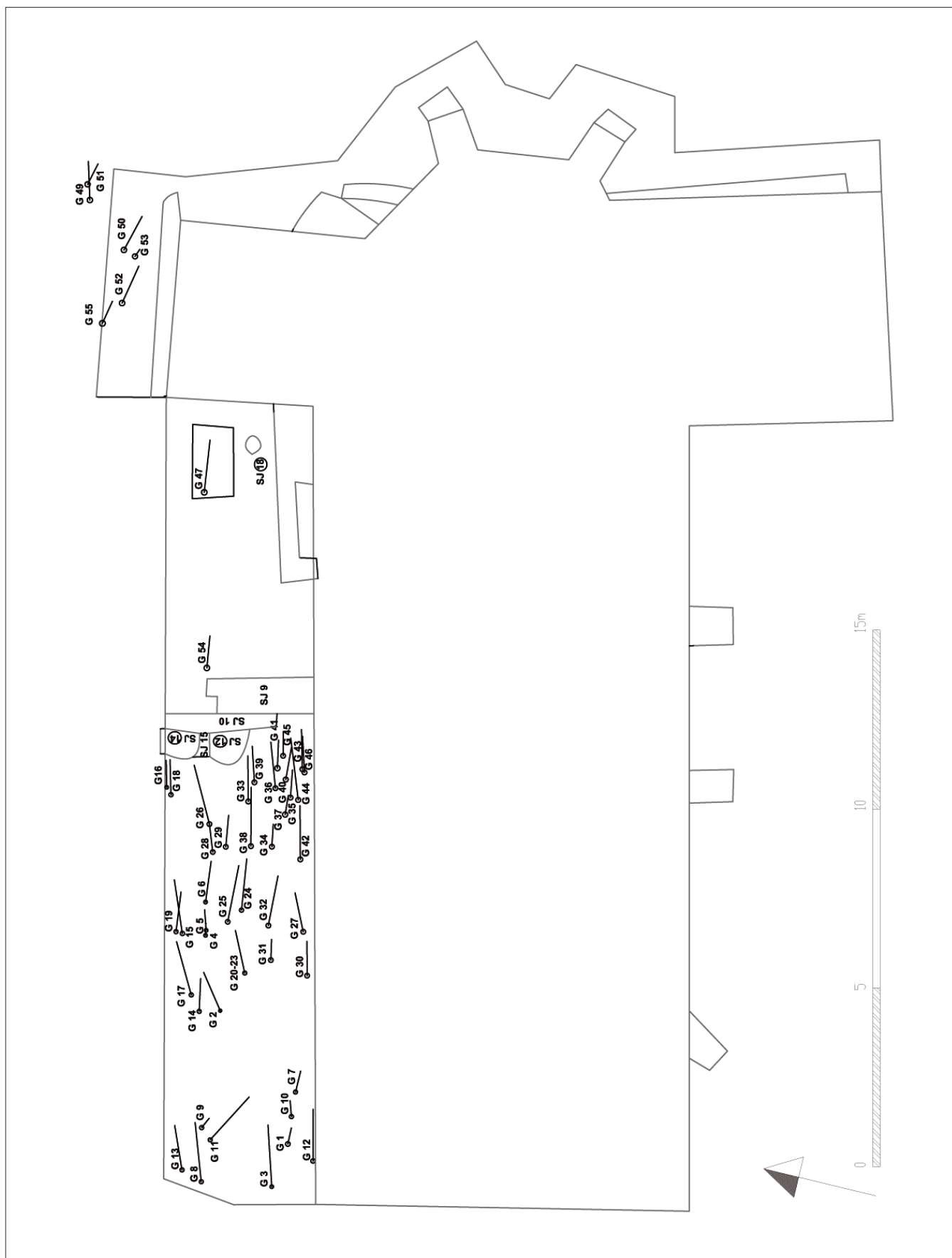
Sl. 1 Shematski tlocrt crkve i istraženih grobova (izradio: H. Vulić; prilagodila: K. Turkalj) Fig. 1 Schematic ground plan of the church and excavated graves (made by: H. Vulić; adapted by: K. Turkalj)