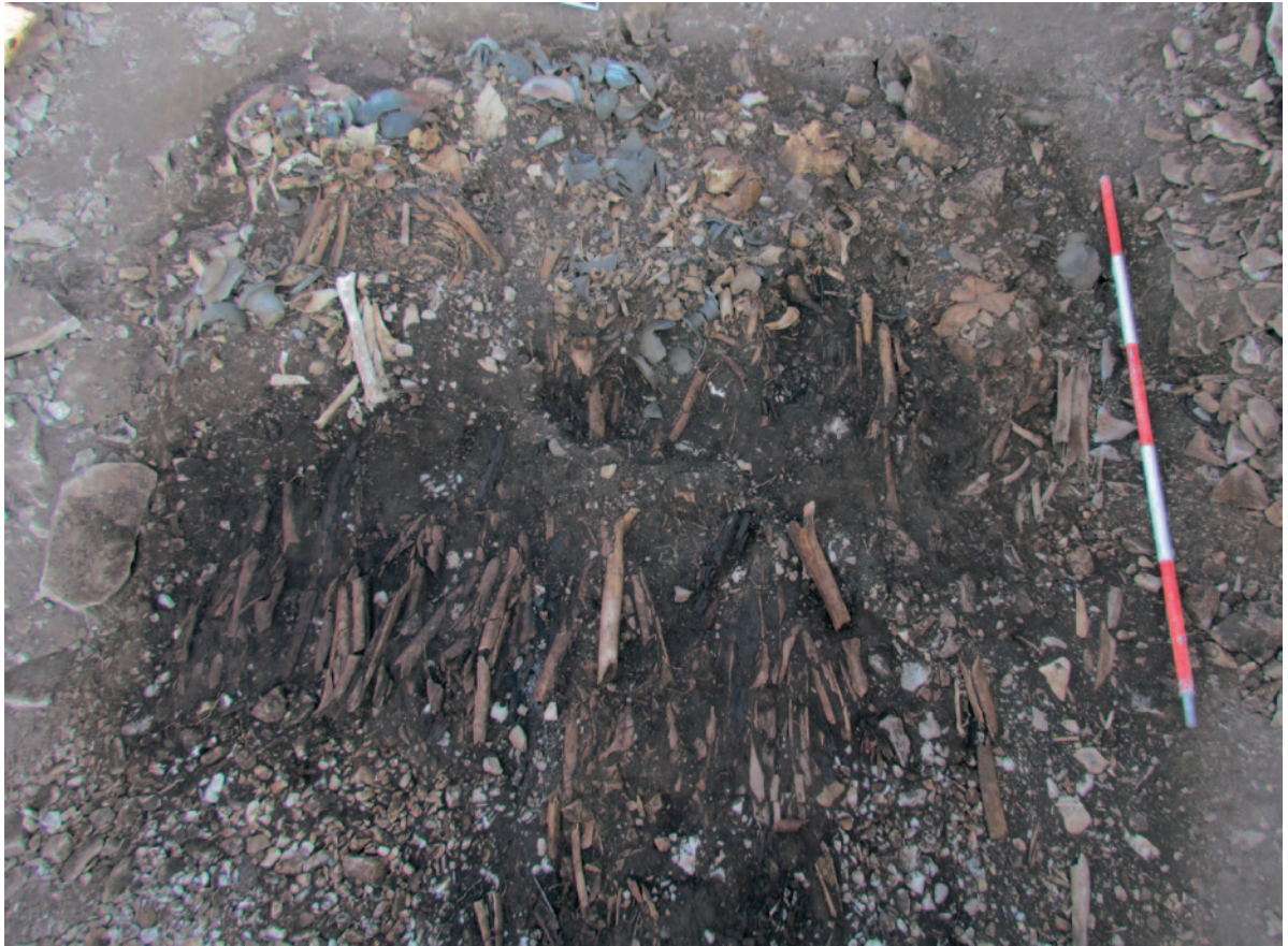
Fig. 7 – Kopila, Tomb 4