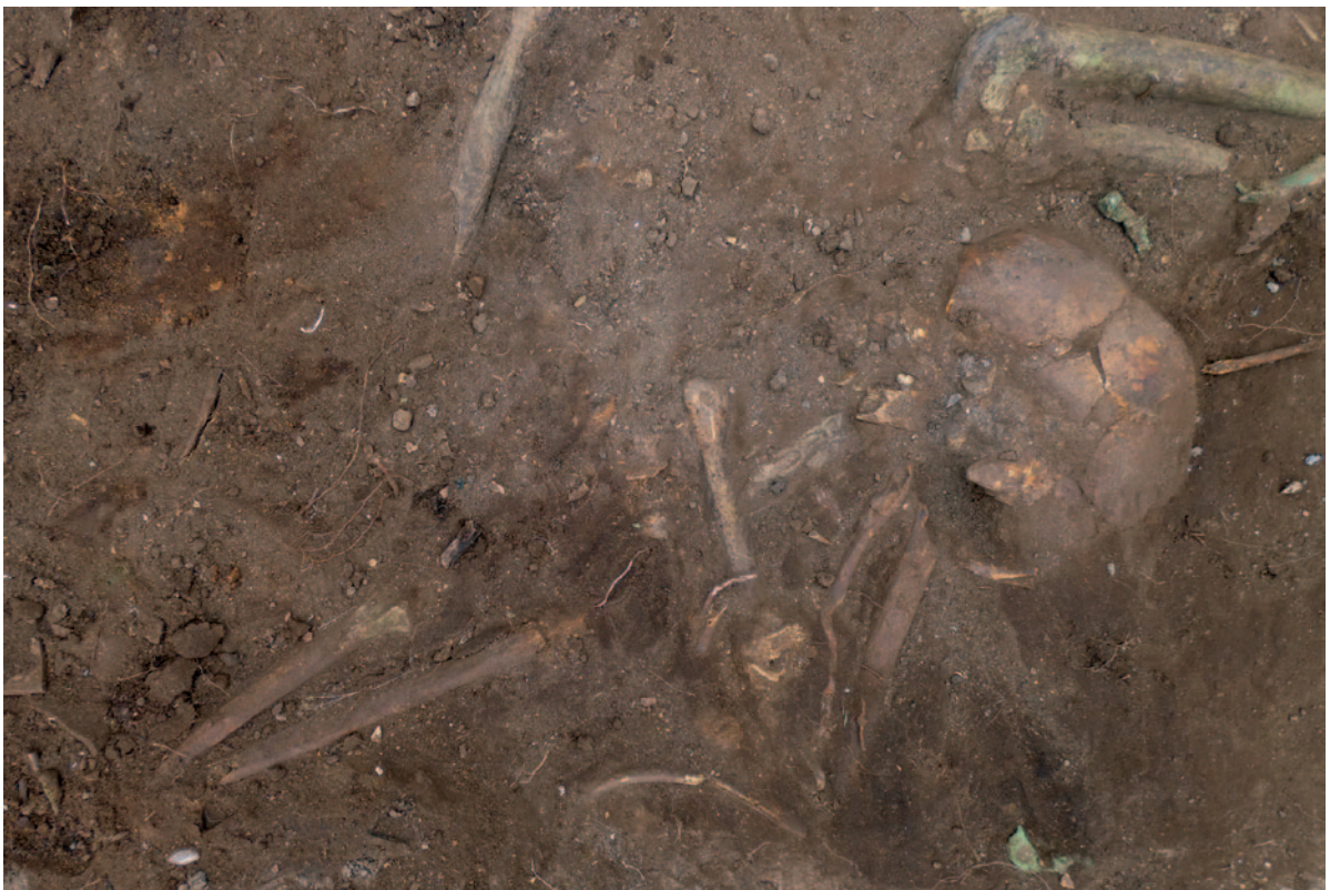
Fig. 8 – Nadin, Tomb 105, individual in crouched position