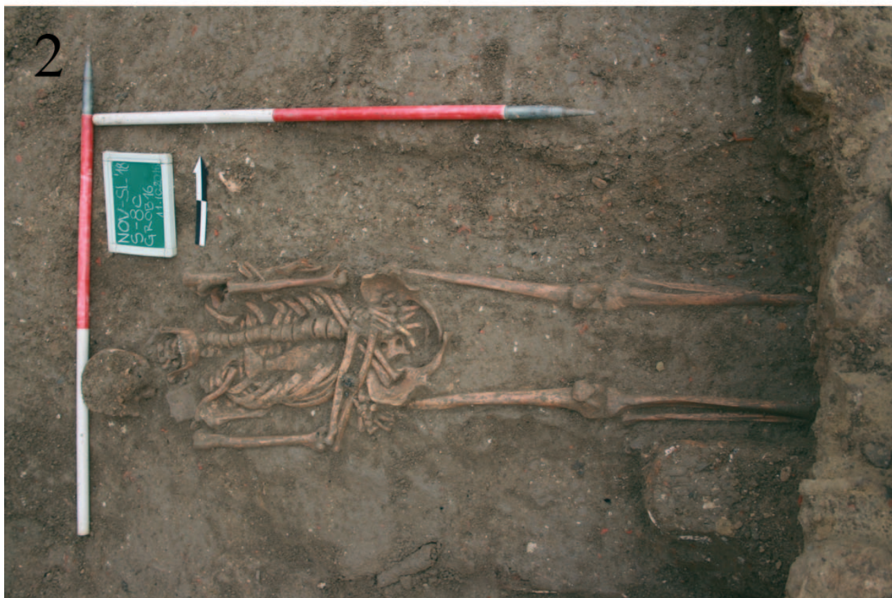
Sl. 1 – 1 Podjela lokaliteta na sektore s označenim sektorom u kojemu je pronađen grob 16 (prema Belaj, Stingl 2019: sl. 1; uz dozvolu; prilagodila: T. Kokotović); 2 Grob 16 (izradila: T. Kokotović, 2024) Fig. 1 – 1 Division of the site into sectors with the marked sector where grave 16 was found (after Belaj, Stingl 2019: Fig.1; with permission; adapted by: T. Kokotović); 2 Grave 16 (made by: T. Kokotović, 2024)