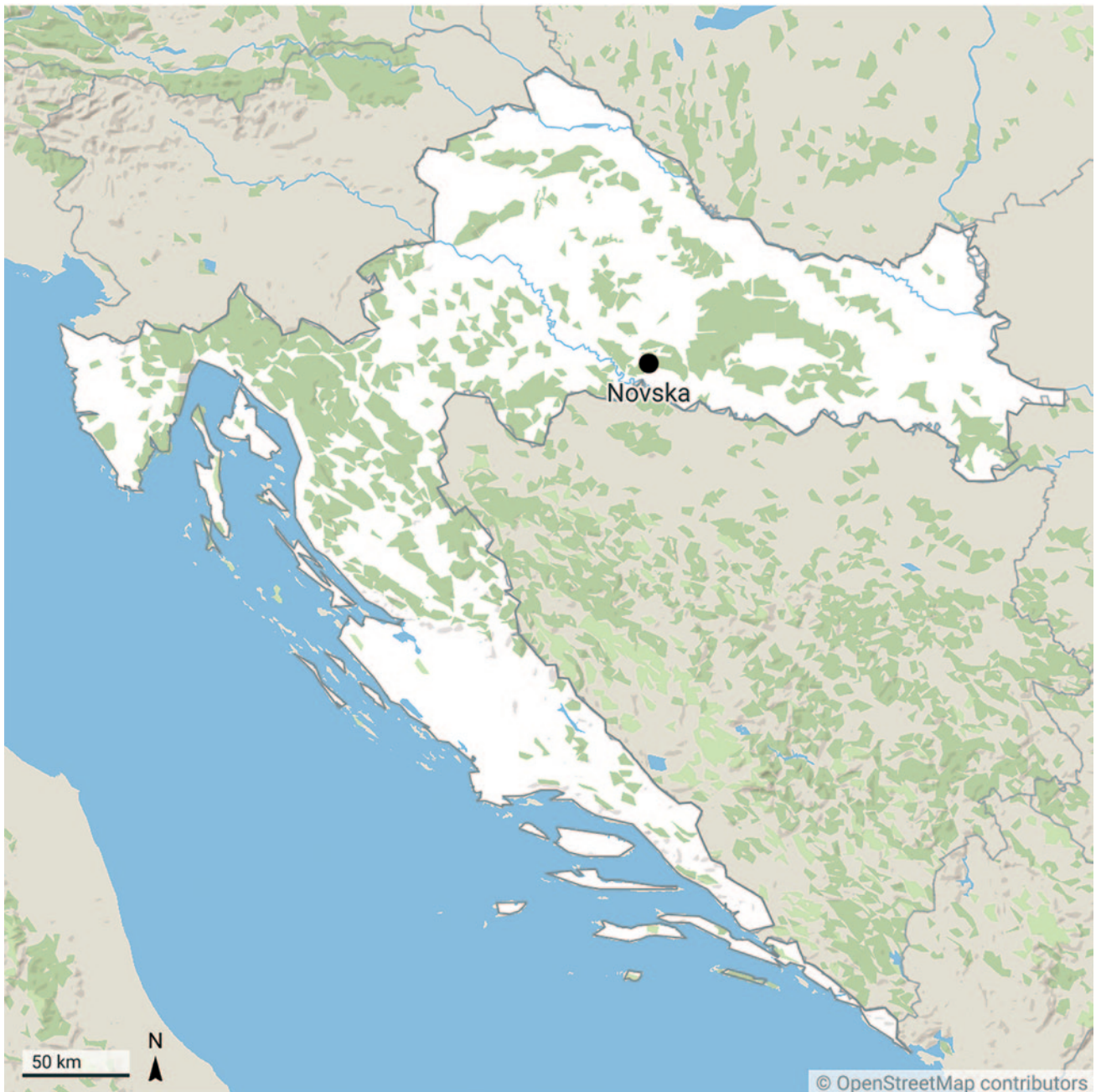
Karta 1 – Položaj crkve sv. Luke Evanđeliste u Novskoj (izvor: OpenStreetMap, Creative Commons Attribution-ShareAlike 2.0 license, CC BY-SA 2.0; Created with Datawrapper; izradila: T. Kokotović, 2024)

Map 1 – Position of the Church of St. Luke the Evangelist in Novska (source: OpenStreetMap, Creative Commons Attribution-ShareAlike 2.0 license, CC BY -SA 2.0; created with Datawrapper; made by: T. Kokotović, 2024)