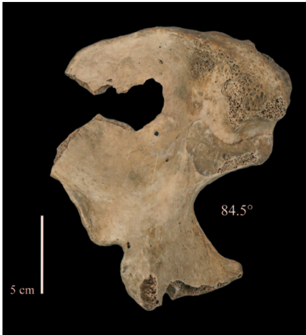
Sl. 6 – Kut velikog sjednog ureza na desnoj zdjelici Fig. 6 – Great sciatic notch angle on the right pelvic bone

postmortalnog oštećenja kosti, na lijevoj strani kut velikog sjednog ureza nije bilo moguće izračunati. Glave obje bedrene kosti manjeg su opsega i volumena nego u normalnim slučajevima (sl. 7). Glava desne bedrene kosti je djelomično sačuvana, a glava lijeve bedrene kosti (koja je kompletno sačuvana) ovalnog je oblika, dimenzija 30 x 45 mm te je na njoj uočen porozitet. Vrat obje bedrene kosti je blago skraćen i zadebljan. Mali obrtač na obje bedrene kosti izduženog je oblika. Povećana anteverzija vrata uočena je na lijevoj bedrenoj kosti. Kut anteverzije na desnoj bedrenoj kosti iznosi 11,3°, a na lijevoj 38,6°.