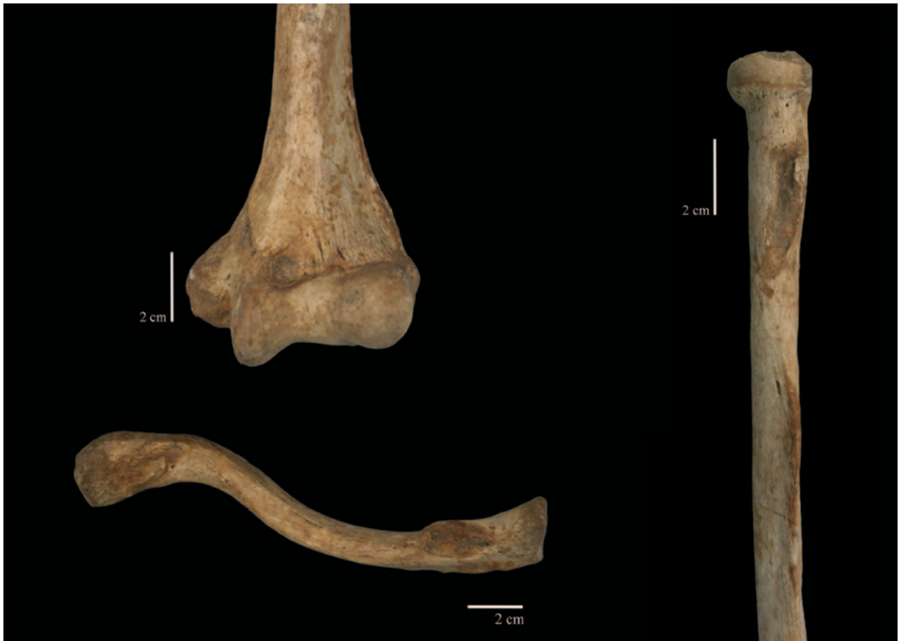
Sl. 2 – Entezalne promjene na nadlaktičnoj, ključnoj i palčanoj kosti Fig. 2 – Enthesal changes on the humerus, clavícula, and radius