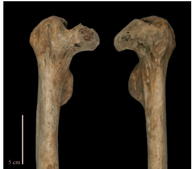
Sl. 7 – Glave desne i lijeve bedrene kosti kostura iz groba 16 Fig. 7 – Left and right femoral heads of the skeleton from grave 16

Legg-Calvé-Perthesova bolest definira se kao osteohondroza glave bedrene kosti, a rezultat je opstrukcije krvotoka u predjelu glave