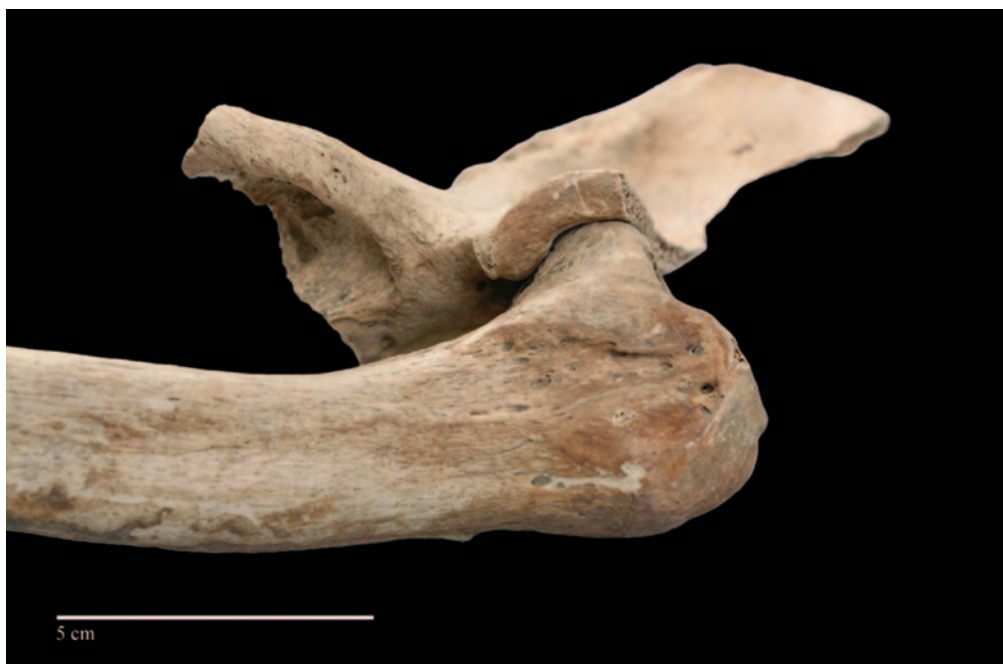
Sl. 8 – Lijevo lažni zglob kuka na kosturnim ostacima iz groba 16 Fig. 8 – Left false hip joint on the skeletal remains from grave 16

16 mogu povezati s RPK-om. U srednjovjekovnoj populaciji Londona povećana anteverzija vrata bedrene kosti zabilježena je u čak 83 % slučajeva (Mitchell Redfern 2008: 65), kao i na tri od devet kostura s RPK na groblju katedrale Notre-Dame-du-Borg u Digneu u Francuskoj (Mafart et al. 2007: 30–32) te u slučaju bilateralnog RPK iz Cape Towna u Južnoj Africi (Voegt et al. 2023: 30). U istraživanju RPK u srednjovjekovnoj populaciji Londona Mitchell i Redfern (2008) su također uočili širi kut sjednog ureza na pogođenoj strani u većini unilateralnih i bilateralnih slučajeva RPK. Vrijednosti kuta velikog sjednog ureza kretale su se u rasponu od 50° do 110° s prosječnom srednjom vrijednosti koja iznosi 85° (Mitchell, Redfern 2008: 64) što odgovara vrijednosti kuta sjednog ureza osobe iz groba 16. Širi kut velikog sjednog ureza zabilježen je u unilateralnom slučaju RPK kod djeteta iz srednjovjekovne Poljske (Agnew, Justus 2013), te u bilateralnim slučajevima RPK kod odraslih osoba u Nizozemskoj (Katzmarzyk, Schats 2011), Južnoj Africi (Voegt et al. 2023) i Argentini (Plischuk et al. 2018). Kao posljedica RPK-a, različiti oblici kompenzacijskih asimetrija mogu se pojaviti na području kralježnice te služe kao jedan od kriterija u dijagnozi ovog poremećaja na kosturnim ostacima. Na anteriornom dije-