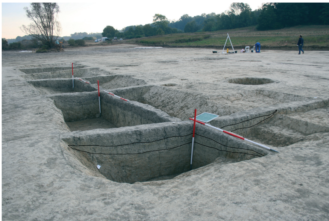
Fig. 4 — Auxiliary profiles within the basement of the house dated to the second half of the 13 th century, with marked three layers of the filling

Preliminary analysis of animal bones was made for the complete archaeozoological material and, for now, we have no data on a possible distinction in the representation of individual species in a particular horizon. Within the whole identified