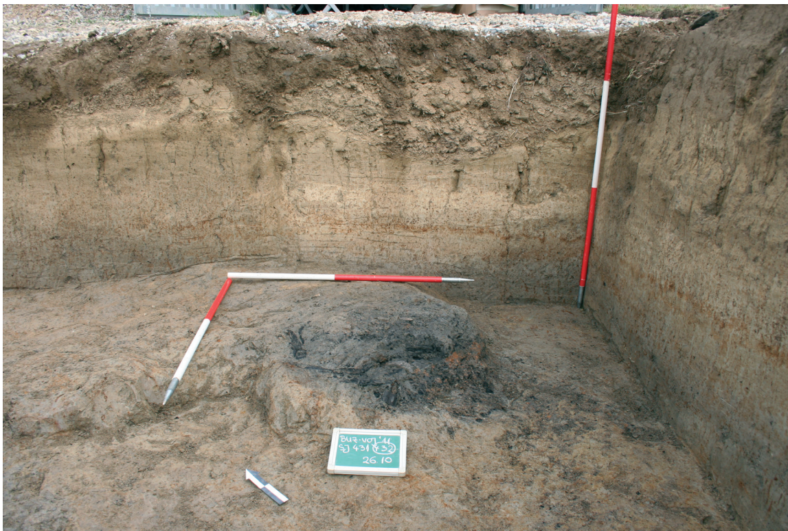
Fig. 6 — Colluvial sediments covering the remains of the settlement from the first half of the 15 th century, pit SU 431/432