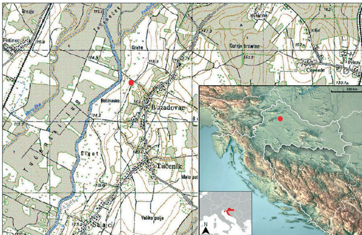
Fig. 1 — The position of the Buzadovec – Vojvodice site on a topographic map (State Geodetic Administration, TK 1 : 25,000, Haganj 322-1-1; made by: T. Kkalčec)

Sl. 1 — Položaj nalazišta Buzadovec – Vojvodice na topografskoj karti (Državna geodetska uprava, TK 1 : 25 000, Haganj 322-1-1; izradila: T. Kkalčec)