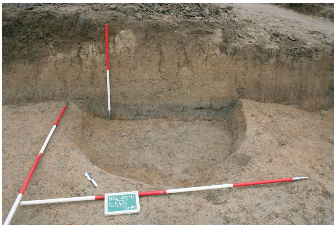
Fig. 5 — Colluvial sediments covering the remains of the settlement from the first half of the 15 th century, pit SU 439/440

It is important to point out that the archaeozoological analysis of the bones from the upper layer of the house with the basement indicated that the bones were exposed to the weather for a long time and that, immediately after the bones were laid in the sediment, the surface was overgrown with vegetation, unlike in the other buildings on the site. Precisely this fact, as well as the