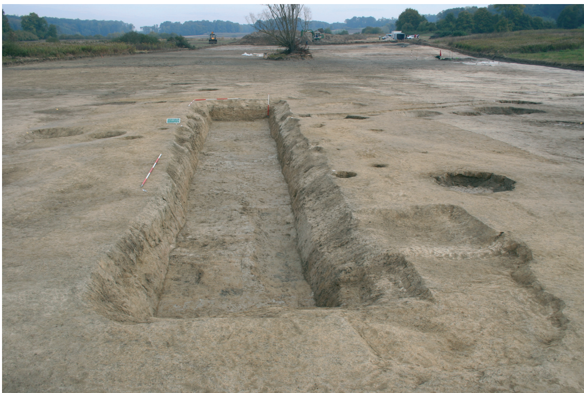
Fig. 3 — The house with a basement, dated to the second half of the 13 th century, after the excavation

The house manifested itself as a 21 m long and 3.5 to 3.9 m wide dark grey stain under the humus layer (Tkalčec 2013: 81, Fig. 4). The lower fillings of the dug in part of the building were lighter yellow and lighter grey in colour and contained fewer finds than the upper layer (Fig. 4). The basement of the building itself is a dug in space of almost vertical walls, about 90 cm deep, 18.9 m long and with an average width of 2.5 m. The shallow extension in the south-eastern part of the building measures 5.20 m (northeast – southwest) x 2.20 m (northwest – southeast) and is about 20 cm deep. It protrudes to the south about 1 m outside the line of the southern façade of the basement. This extension may have been the entrance to the basement. The initial situation indicates that the