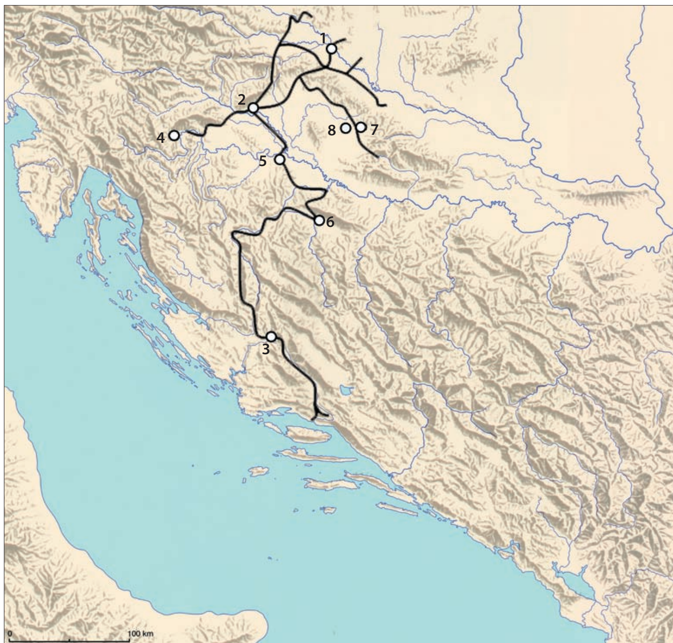
Sl. 1 Karta s označenim položajima crkava s titularom sv. Stjepan Kralj južno od Drave i pravci srednjovjekovnih cestovnih komunikacija: 1-Torčec-Cirkvišće; 2-Zagreb-Kaptol; 3-Knin; 4-Šemič kod Črnomelja; 5-stara Petrinja, Jabukovac (?); 6- Puharska kod Prijedora (?); 7-Zdenci (?); 8-Hercegovac(?)

Fig. 1 A map with marked positions of churches with the titular of St Stephen the King south of the Drava, and the directions of mediaeval road communications: 1-Torčec-Cirkvišće; 2-Zagreb-Kaptol; 3-Knin; 4-Šemič near Črnomelj; 5-old Petrinja, Jabukovac (?); 6- Puharska near Prijedor (?); 7-Zdenci (?); 8-Hercegovac(?)