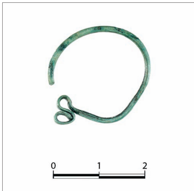
Sl. 4 Torčec – Ledine – S-karičica izrađena od slitine bakra