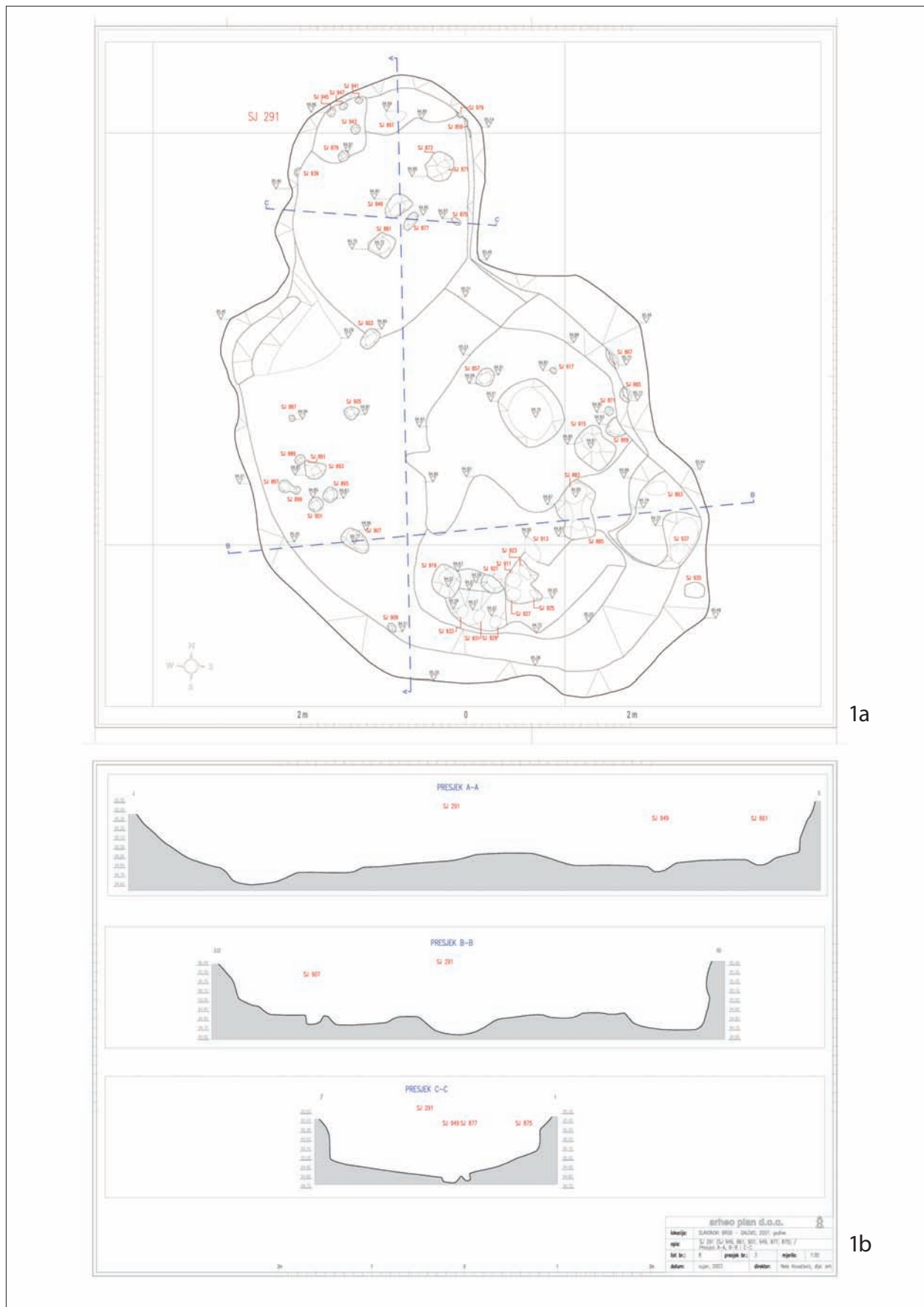
Sl. 1 a) Tlocrt radne zemunice 291 na Galovu u Slavonkom Brodu (izradila: N. Kovačević, Arheo plan d.o.o.), b) Presjeci radne zemunice 291 na Galovu u Slavonkom Brodu (izradila: N. Kovačević, Arheo plan d.o.o.)