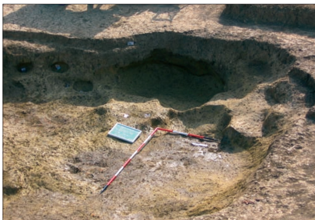
Sl. 3 Slavonski Brod, Galovo, južni dio radne zemunice s rupama od drvenih stupova