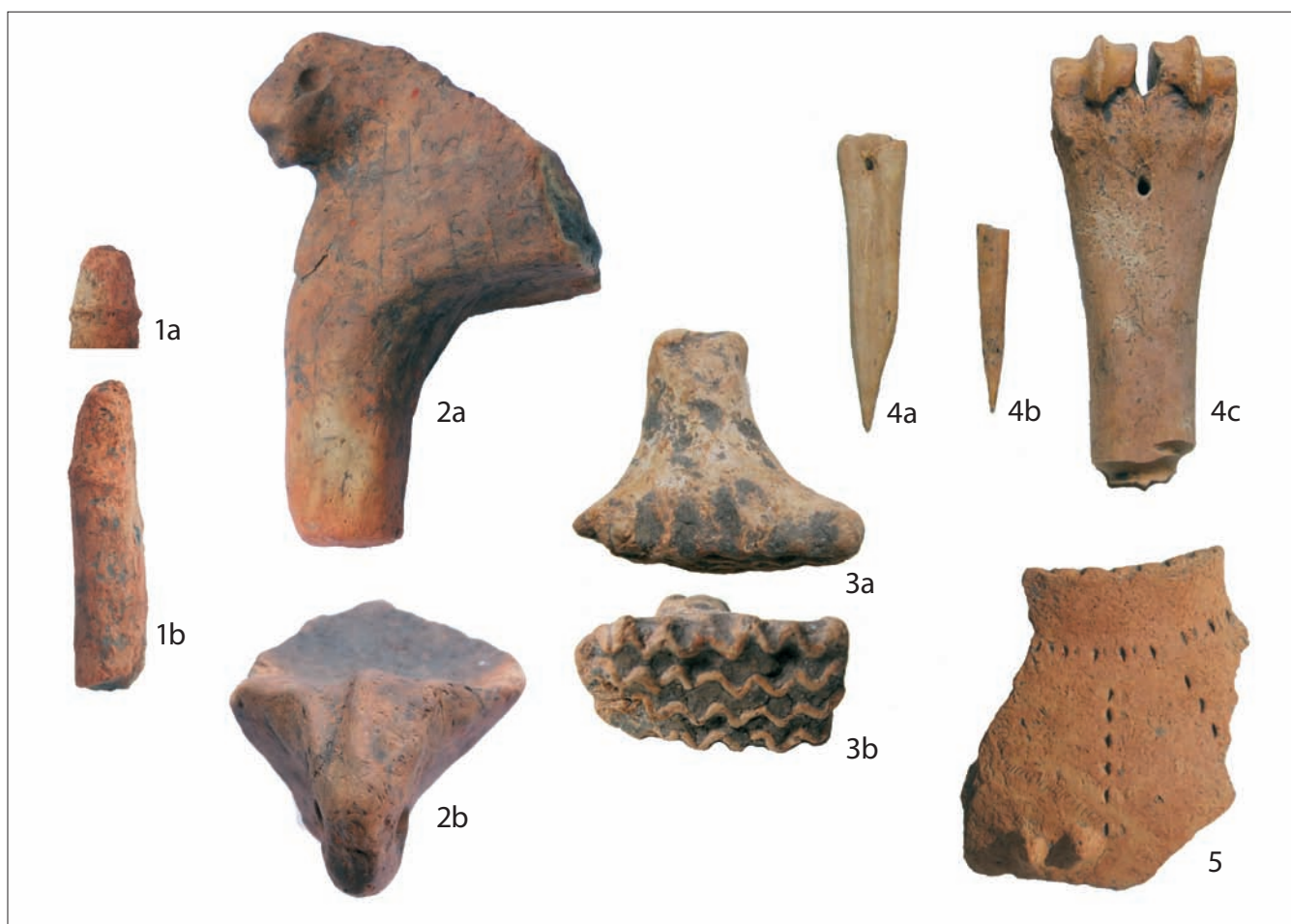
Sl. 5 Radna zemunica 291: 1a i b antropomorfna protoma na žrtveniku; 2a i b noga žrtvenika s protomom ovna i urezanim znakovima; 3a i b pintadera; 4a,b,c koštana šila – igle; 5 ulomak lonca s urezanim ukrasnim šavovima na trbuhu