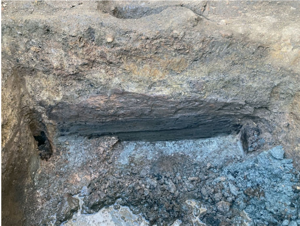
Fig. 3 — Detail of the wooden framework of the structure during archaeological research Sl. 3 — Detalj drvene oplata objekta tijekom arheoloških istraživanja

of presumed above-ground structures. Also, the northern part of the structure was destroyed by the construction of a masonry sewerage system (SU 48) at the end of the 19 th century, partially disturbing the stratigraphic image.