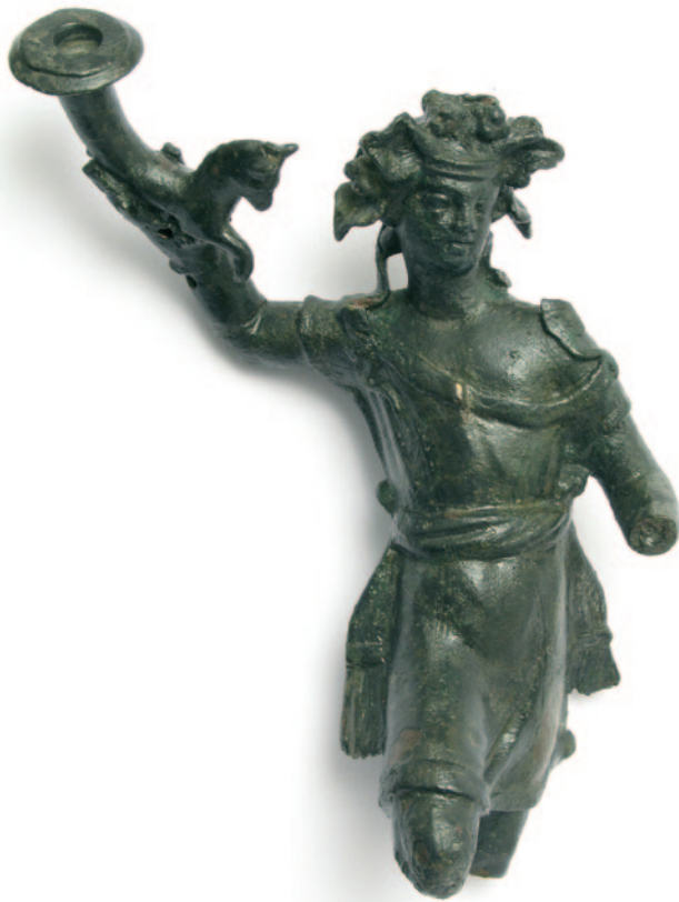
Sl. 9 — Kipić Lara, Salona, Arheološki muzej Split, inv. br. H-5474, uz dozvolu

Fig. 9 — Statuette of a Lar, Salona, Archaeological Museum Split, inv. no. H-5474, with permission