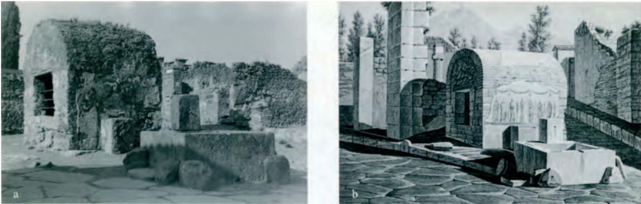
Sl. 3 – Kompitalno svetište, Pompeji (Van Andriga 2000: sl. 1)