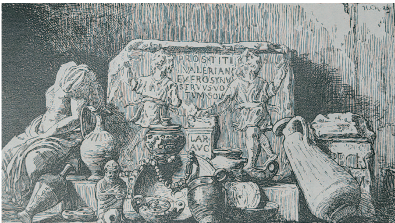
Sl. 4 — Crtež reljefa s prikazom Lara, Salona (Jelić, Bulić, Rutar 1894: T. XV) Fig. 4 — Relief drawing depicting the Lares, Salona (Julić, Bulić, Rutar 1894: Pl. XV)