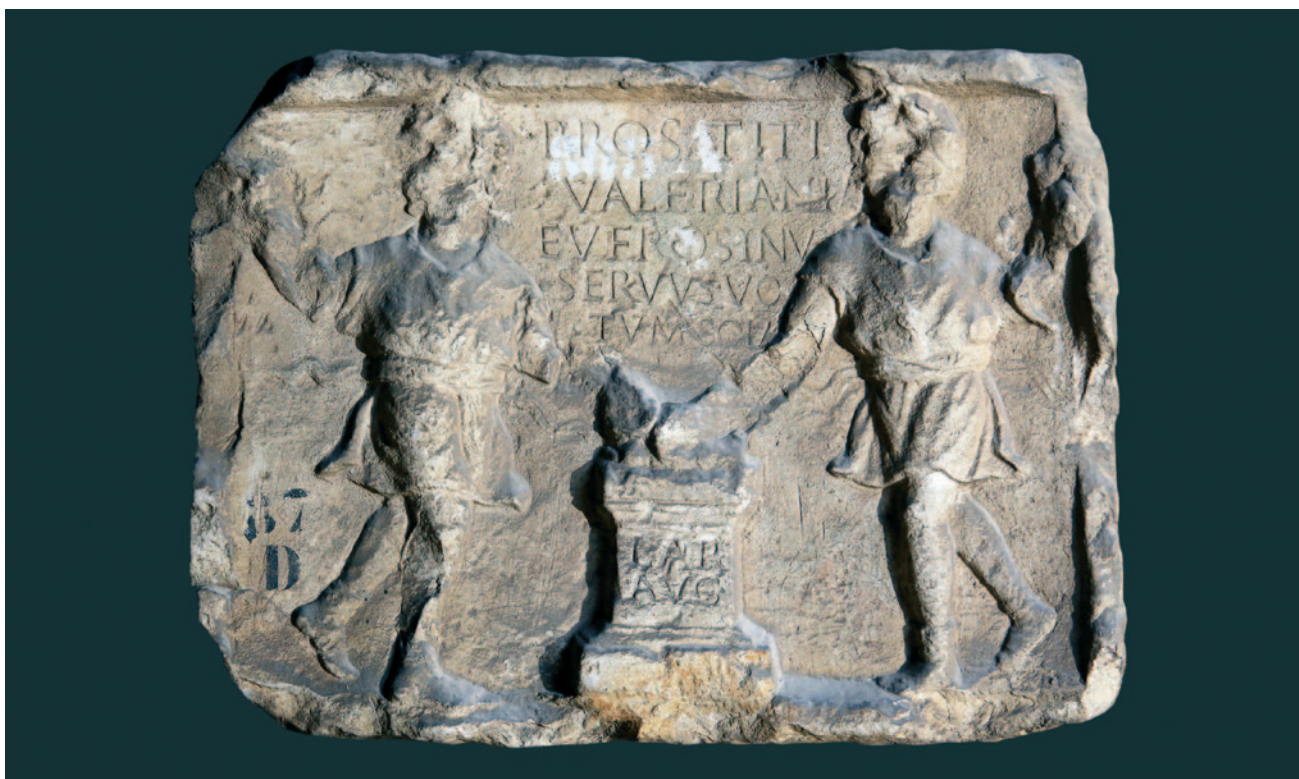
Sl. 5 — Reljef s prikazom Lara, Salona, Arheološki muzej Split, inv. br. A 865, D87, uz dozvolu Fig. 5 — Relief depicting the Lares, Salona, Archaeological Museum Split, inv. no. A 865, D87, with permission