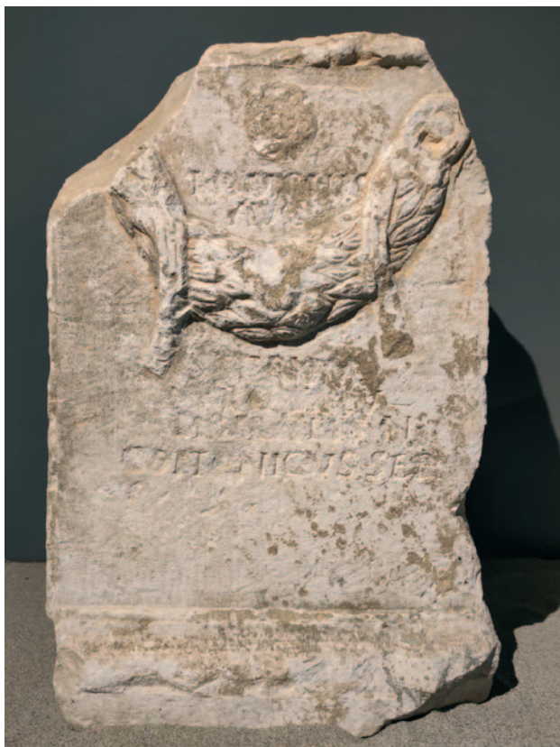
Sl. 6 — Žrtvenik posvećen Nimfama Augustama, Kaštel Sućurac Fig. 6 — Altar dedicated to the August Nymphs, Kaštel Sućurac