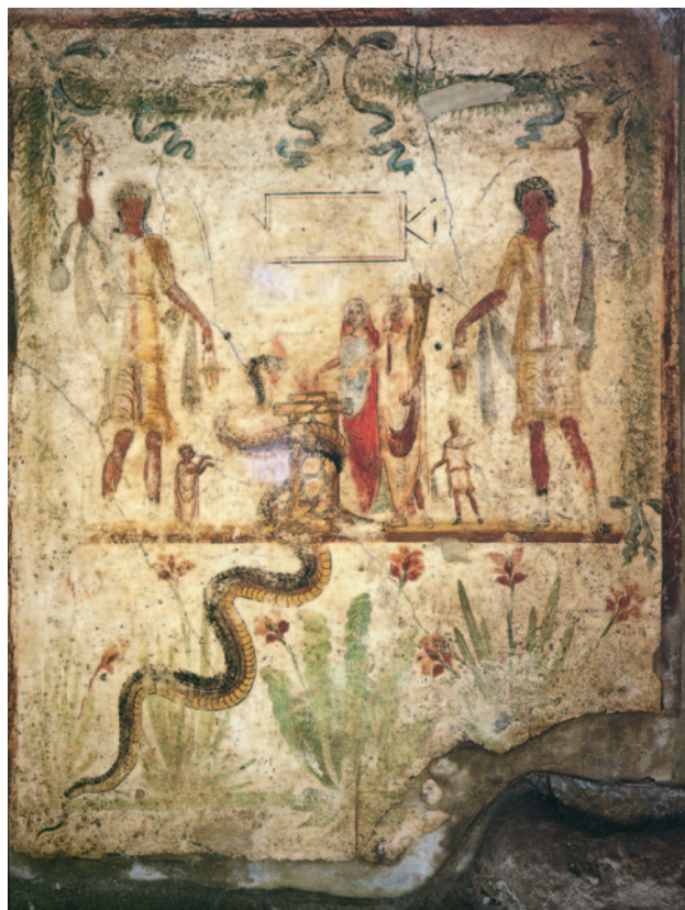
Sl. 7 — Lararij s prikazom žrtvovanja Juno i Genija Larima, kuća Julija Polibija, Pompeji (© Ranieri Panetta 2005: 108) Fig. 7 — Lararium with a depiction of the sacrifice of Juno and Genius to the Lares, House of Iulius Polybius, Pompeii (© Ranieri Panetta 2005: 108)

koji pokazuje da je posveta podignuta Augustovim Larima ili Laribus Augustis da je posveta podignuta Uzvišenim Larima. U prva dva slučaja riječ je o Augustovim vlastitim božanstvima. Već smo prethodno spomenuli da je 7. g. pr. Kr. August preustrojio administrativni sustav grada Rima čime je glavni grad podijelio na 14 okruga i 265 gradskih četvrti ( vici ). Svaka je gradska četvrt štovala unutar svojeg svetišta ( compita ) kult Lara raskrižja ( Lares Compitales ), te je ovom prilikom car August zamijenio spomenute javne Lare svojim obiteljskim i dodjelio im epitet Augusti , koji se od tada nazivaju Lares Augusti . Time se Augustovim Larima prinose žrtve i molbe za samog cara. Georg Wissowa smatra da je ovaj epitet pokazivao da su se oni štovali na isti način na koji ga je car štovao u svojem obiteljskom kultu (Wissowa 1912: 166–175). Međutim, Duncan Fishwick to osporava i kaže da je ipak prevelik broj božanstva nosio taj epitet, od kojih su mnogi bili lokalnog provincijskog karaktera i teško da su svi oni mogli imati posebno mjesto u carskoj kući