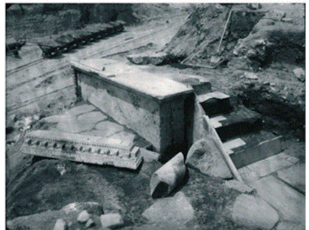
Sl. 2 — Rekonstrukcija i in situ ostatci Compitum Acili , Rim (© Colini 1933: 81, sl. 2; © Colini 1962: 152, sl. 7)

Their cult was organized and supervised by freedmen, slaves or Roman citizens of lower status, 9 especially in the Compitum shrines which were located at the crossroads ( compita ) 10 in local neighborhoods ( vici ). 11 The crossroads could be bigger or smaller, and the shrines could be more monumental or simpler. Thus some had real small “temples” on podiums with several altars in front, while others consisted of shrines open to the sky ( sacella ) 12 (Fig. 2).