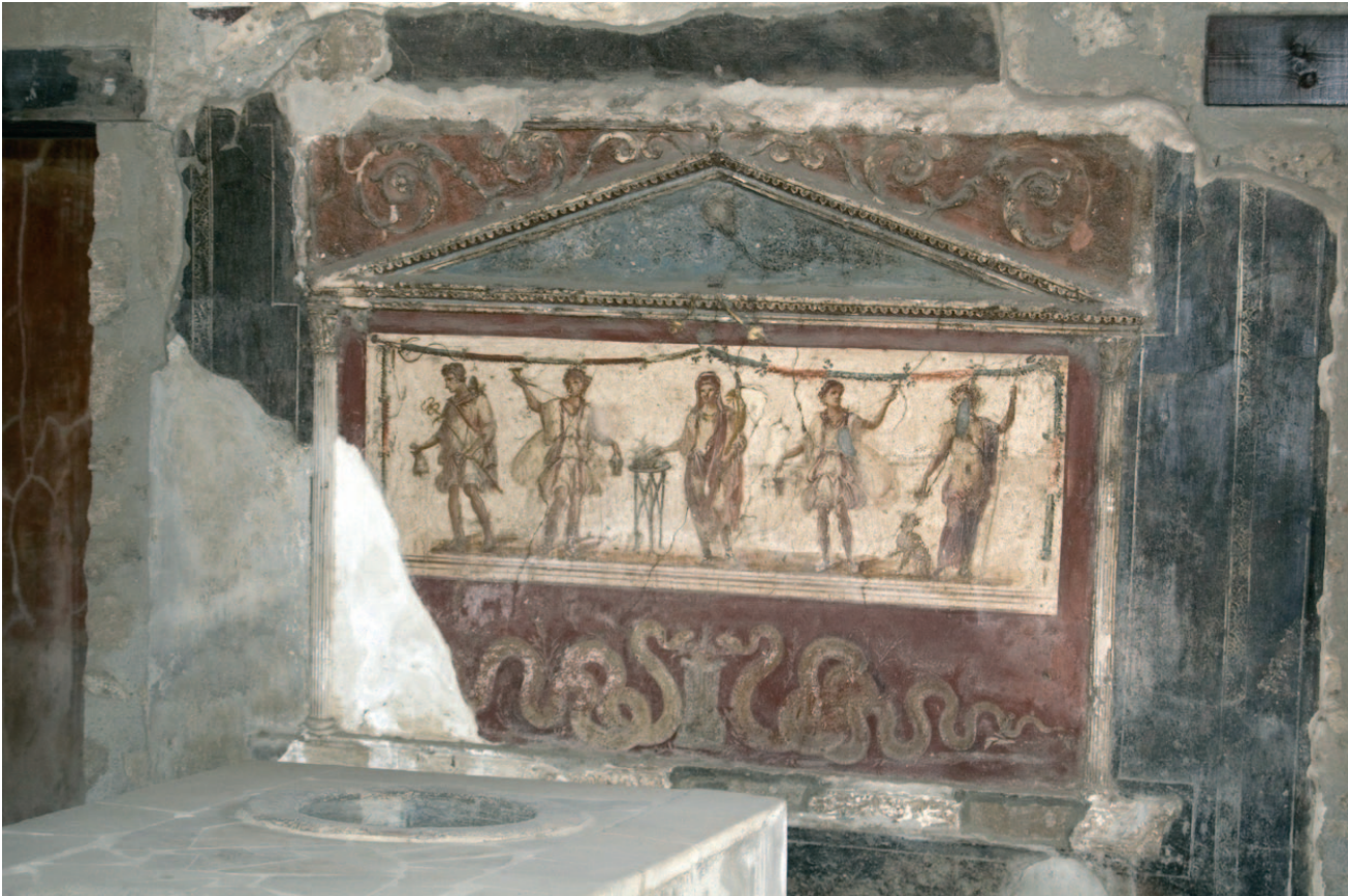
Sl. 1 — Lararij uz kućno ognjište ( casa di Vetutius Placidus ), Pompeji Fig. 1 — Lararium next to the home hearth ( casa di Vetutius Placidus ), Pompeii

mladića odjevenih u tuniku veselog izraza lica, s rogom obilja ( cornucopia ) ili paterom. Čuvali su ih u posebno izrađenim ukrasnim ormarićima, nišama, ili malim kućnim svetištima ( aedicula ) 7 , koji su se nazivali larariji ( lararium ), 8 a bili su smješteni u blizini kućnog ognjišta ili ulaza u dom. Njihov prikaz mogao je biti naslikan i na zidu pored ognjišta, unutar malih svetišta (sl. 1).