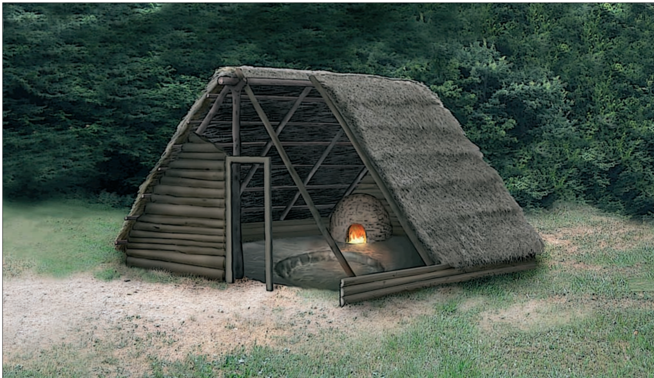
Sl. 2 Virovitica – Kiškorija jug, rekonstrukcija jednodoborne kuće SJ 1242 (crtež: Miljenko Gregl) Fig. 2 Virovitica-Kiškorija jug, a reconstruction of single-room house SJ 1242 (drawing: Miljenko Gregl)

prostoru. Naime, površina stambenog prostora kuća na području Slovačke, Moravske i sjeverne Mađarske kreće se od 4 do 22 m 2 , s time da najveći broj objekata zaprima prostor od 7 do 11 m 2 . Za ostala slavenska područja prosječna kvadratura kuća iznosi 12 do 15 m 2 . U jugoistočnoj i istočnoj zoni slavenskog prostora evidentiran je najveći broj poluukopanih kuća s dva potporna stupa kvadrature od 9 do 12 m 2 , iako postoje primjeri i površinom većih objekata (Šalkovský 2001: 25, 44, Abb. 18: 2). Na području srednjeg Podunavlja površinom najvećim objektima pripadaju tipovi kuća s više potpornih stupova u konstrukciji stijena objekta (Ruttkay 2002: 271). Za naše krajeve u dosadašnjim sintezama nedostaju podaci te su nam u tom smislu rezultati istraživanja kod Virovitice od izuzetna značaja.