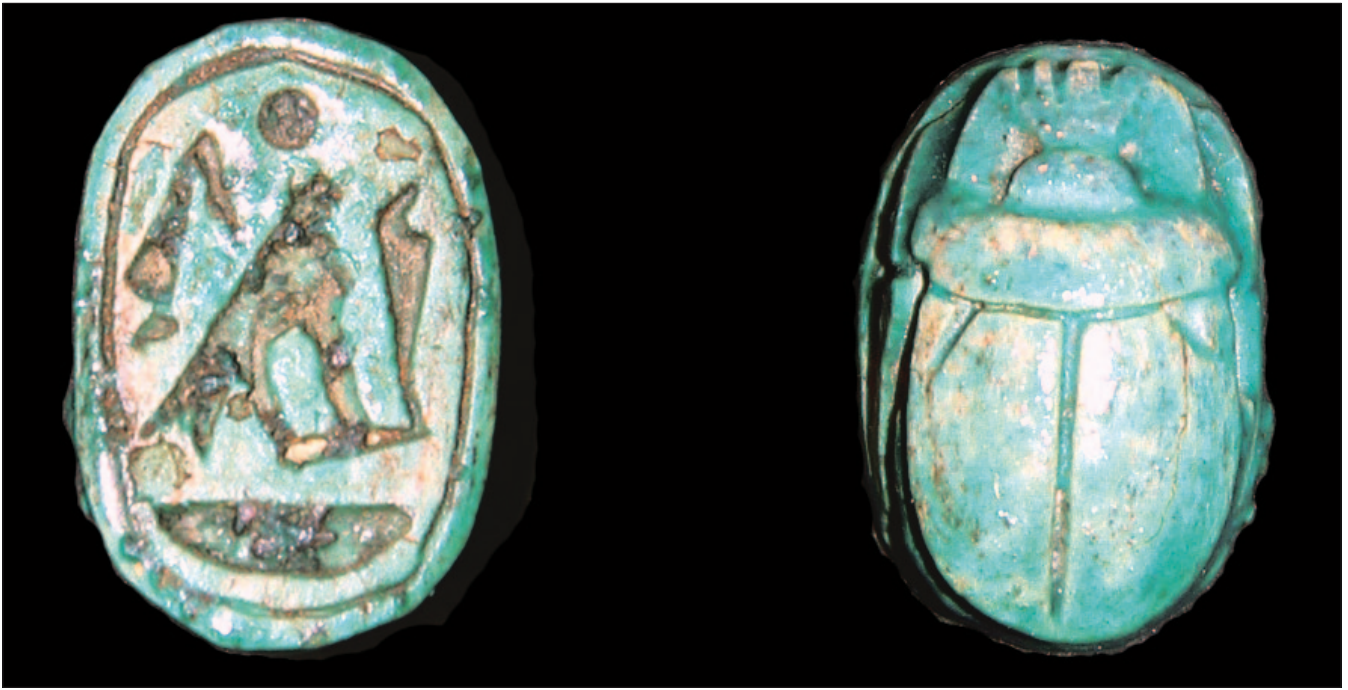
Sl. 1 Skarabej Fig. 1 Scarab

okrenut je nadesno, a uzdignuta kobra smještena je ispred njega (oba su znaka okrunjena sunčevim diskovima); znak nb zatvara polje s donje strane. Prema principima kriptografije koju je formulirao E. Drioton, 5 cjelina se može čitati kao: Jmn-R c nb (.j) – “Amun-Ra je (moj) Gospodar”.