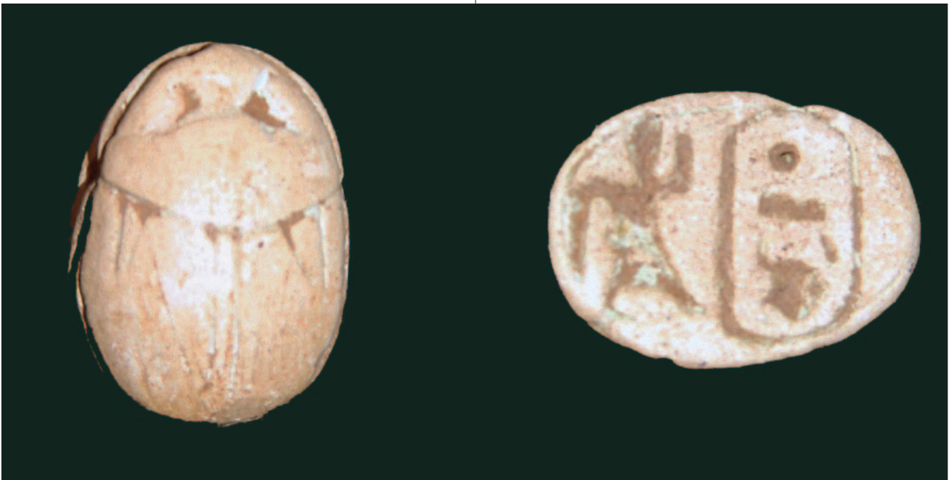
Sl. 2 Skarabej Fig. 2 Scarab