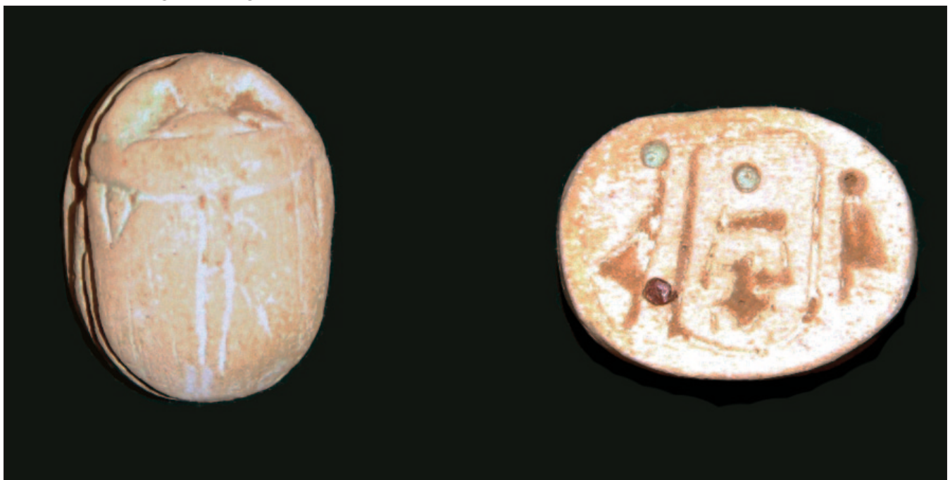
Sl. 3 Skarabej Fig. 3 Scarab

Franciscan Monastery Košljun: without inventory number, on display Unpublished