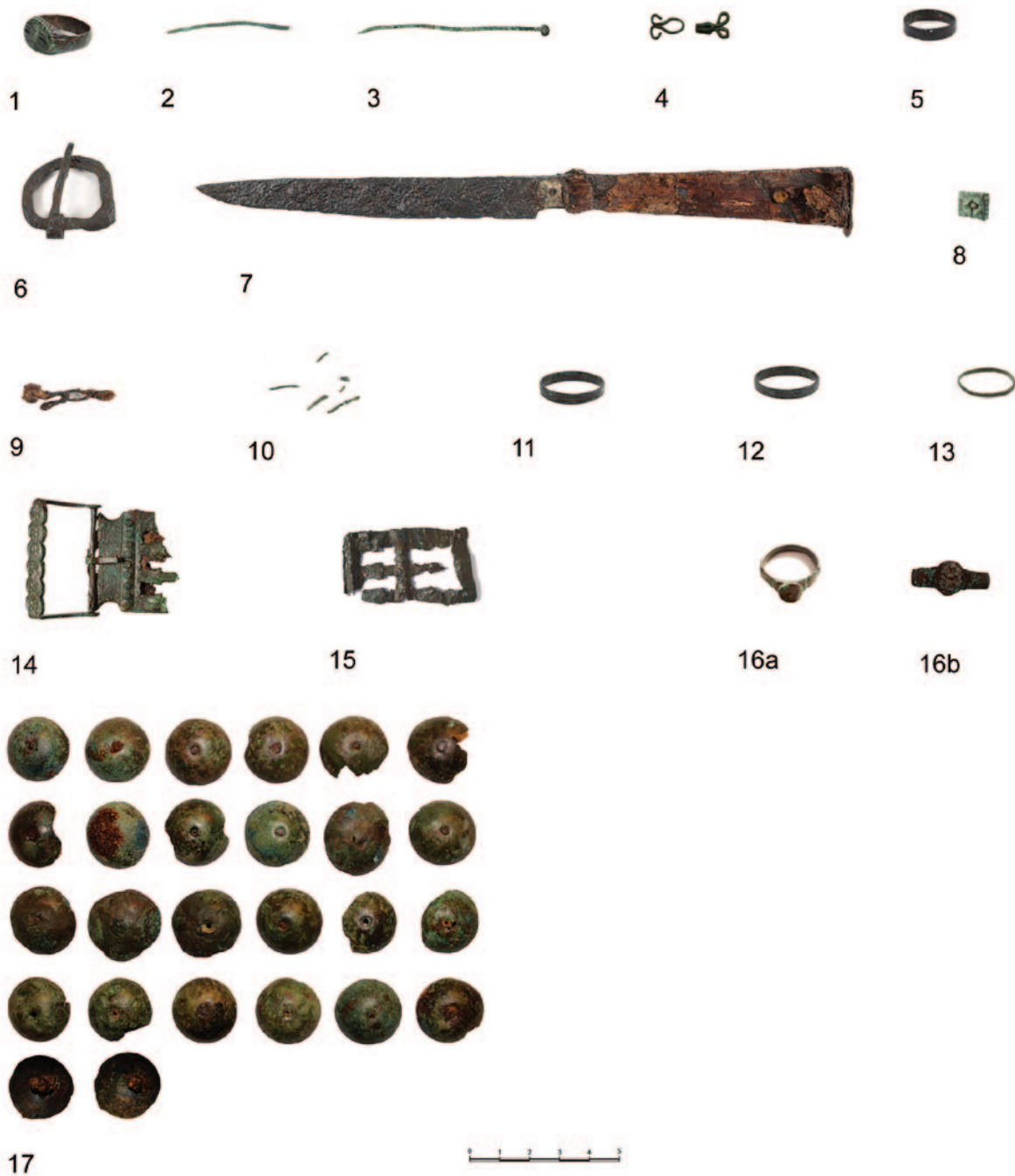
T. 1 Nalazi iz grobova (izradila: K. Turkalj) Pl. 1 Grave finds (made by: K. Turkalj)