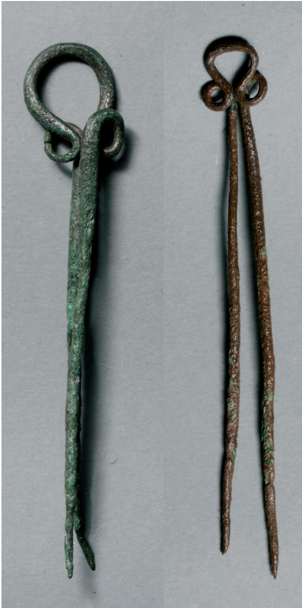
Fig. 14 – Kopila, Tomb 4, double pins of type IIIa

In the Liburnian region, the costume items that stand out in terms of quantity and variety are the fibulae. An impressive number of over 700 specimens has been documented in tomb 105. Strictly statistically speaking, it is slightly more than 3 fibulae per deceased. Given the smaller number of deceased in grave 4 in Kopila and the association of fibulae exclusively with women's attire, the finds numbering over 10 fibulae are also not negligible, although it is still a much smaller ratio (approximately one fibula per individual) when compared to the Nadin burial context. A greater number of fibulae could indicate a different style of clothing, and potentially multi-layered garments; however, such a repertoire may simply represent funeral arrangements where most or all of the possessions of the deceased are attached to clothing. Given the impossibility of associating each fibula with a particular costume, any further discussion on the topic would only be speculation.