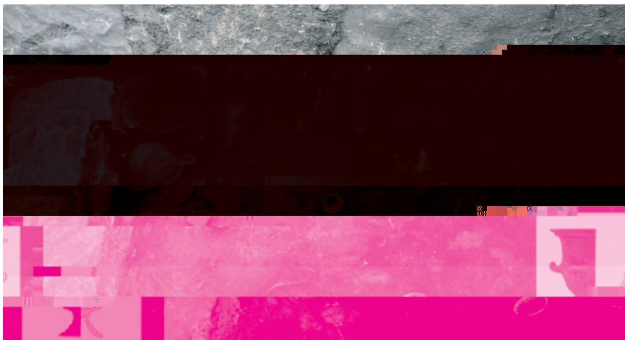
Fig. 11 – Nadin, Tomb 105, pottery assemblages (photo: M. Grgurić; photo and drawing by: L. Bogdanić; made by: M. Čelhar)

North Italian sigillated relief chalice, continued to be placed in the Nadin tomb during the last quarter of the 1 st century BC. It must be pointed out that Tomb 105 included vessels of the local Liburnian Iron Age tradition, which was not the case in the Kopilian necropolis, with the exception of isolated examples of local ceramics in the children's tombs 1 and 7.