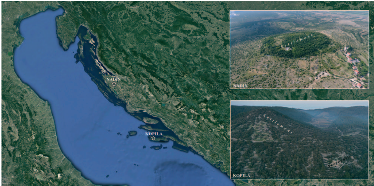
Fig. 1 – Geographical position of Nadin (above; photo: M. Grgurić) and Kopila (below; photo: M. Vuković) hillforts, base map: Google Earth (made by: I. Borzić)

2016; 2017; 2018; 2023a; 2023b; 2023c; Borzić et al. 2018; Zaro, Čelhar 2018; Zaro et al. 2020; Toyne et al. 2021; Knežić 2022; Čelhar et al. 2023; Knežić et al. 2023; for Kopila: Radić, Borzić 2017: 35–58; Borzić 2022).