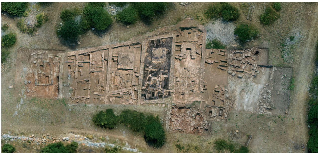
Fig. 2 – Nadin, necropolis

Kukoč 2005; 2006; 2009; Rajić Šikanjić 2006; Kukoč, Čelhar 2010; 2019; Anterić et al. 2011a; 2011b; Batović, Batović 2013; Čelhar, Kukoč 2014; Marijanović et al. 2014; Čelhar 2016; Loewen et al. 2021; Čelhar, Zaro 2023b; 2023c). Its Iron Age strata reflect a regular spatial organization divided into grave plots hitherto unknown in the Liburnian area (Fig. 2). This kind of thing has been recorded in a number of similar sites, but only later, with the arrival of the Romans. Another notable