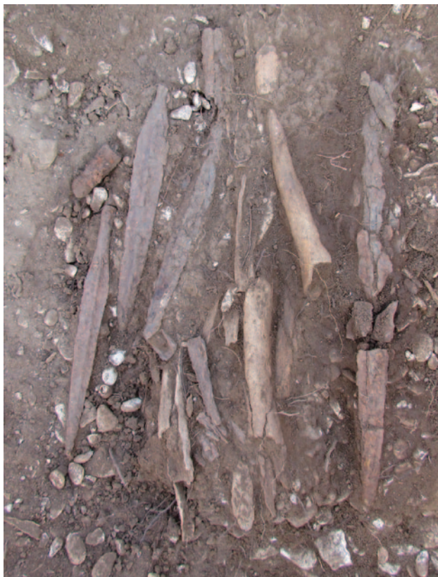
Fig. 12 – Kopila, Tomb 4, spears

type in the grave, but the number of more complete and amorphous iron fragments and their arrangement in the tomb testify that it was most certainly a common good for every male deceased.