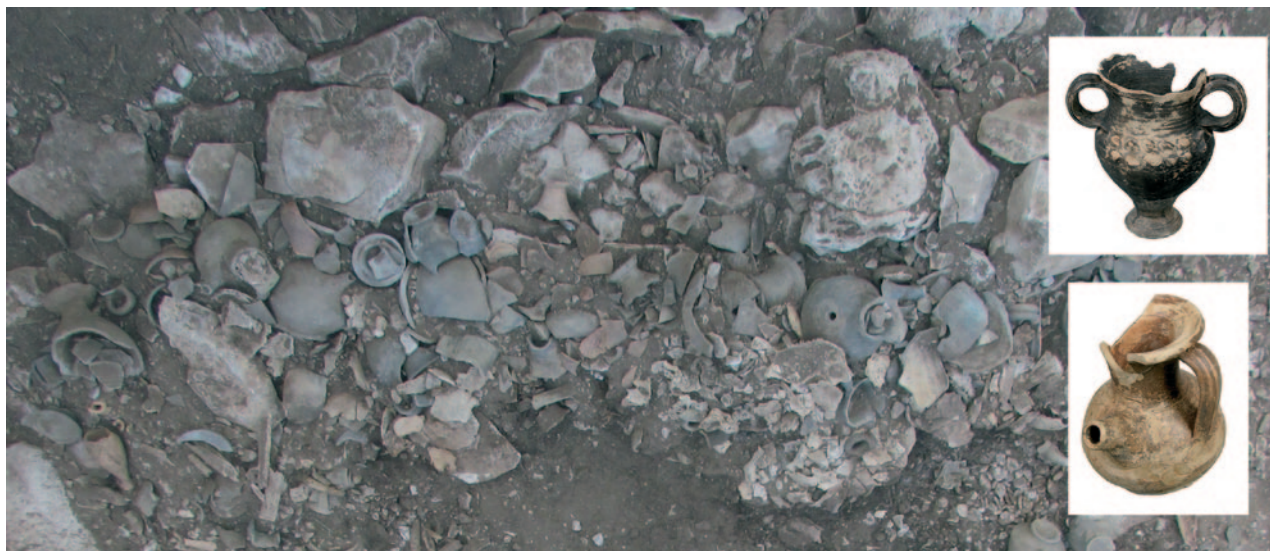
Fig. 10 – Kopila, Tomb 4, pottery assemblage (photos: I. Borzić, P. Igljić; made by: M. Čelhar)

of the grave, 6 with one dominant form. Apart from single or few unguentariae, biconical kantharoi, skyphoi, gutti, bowls, and about twenty relief bowls, the most represented forms (min. 120) are large vessels intended for the preparation/mixing of wine, specifically Hellenistic relief craters (Fig. 11). It is worth mentioning that a very similar type of vessel, the