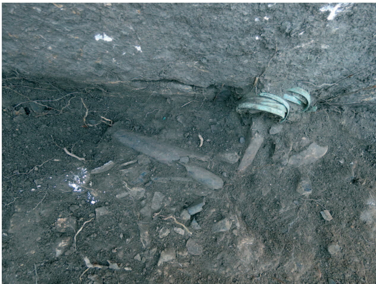
Fig. 17 – Nadin, Tomb 105, bracelets

Details of grave customs and archaeological material recorded in the two tombs presented here allow us to draw some conclusions related to the associated communities of Nadin and Kopila. Firstly, it is clear that both communities exhibited a degree of continuity with their own earlier traditions during the last two centuries BC. This is seen in grave architecture, which was present with its basic concept in Nadin from the 7 th century BC and in Kopila at least from the middle of the 4 th century BC. It is also apparent in the burial practice, including "successive" opposite burials in the case of Kopila and individuals in the lowest/oldest layers placed in the crouched position in the case of Nadin. Also, it is interesting to note that the spatial-organizational plans of the necropolises appear to be