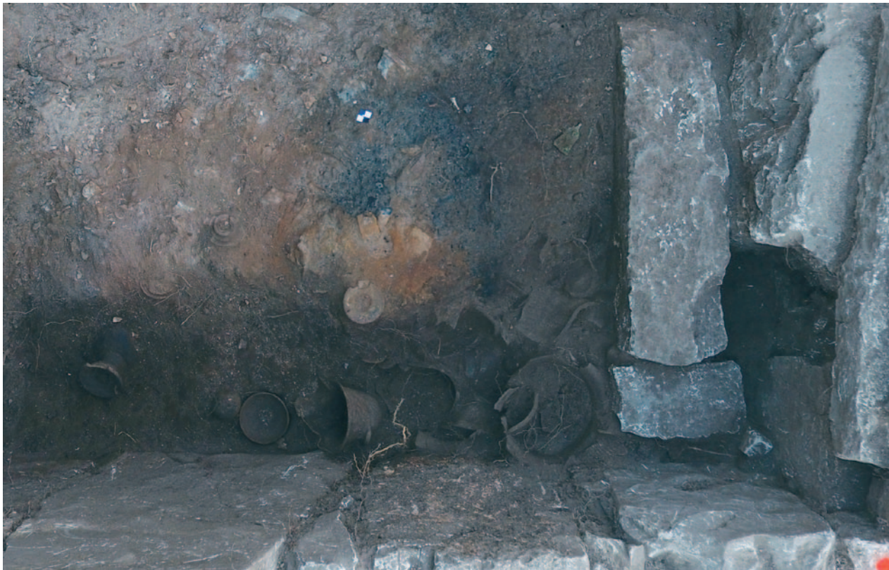
Fig. 9 – Nadin, Tomb 105, burnt layer