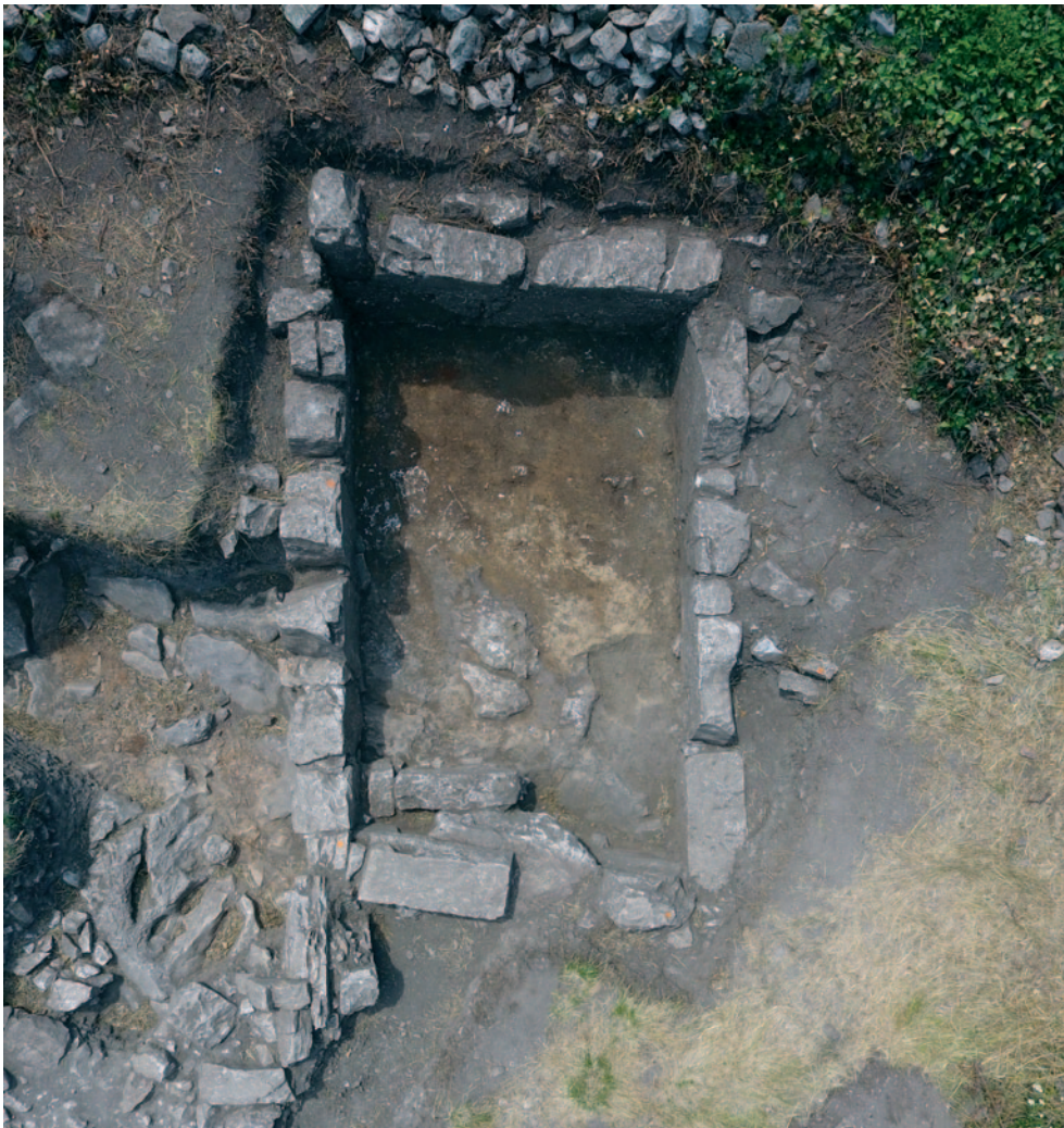
Fig. 4 – Nadin, Tomb 105

The Nadin case is presented by Tomb 105, which was located on the southern edge of the necropolis (Fig. 4). Visually, it is characterized by a very regular rectangular shape (dimensions: 2,93 x 4,30 m), with sides built of vertically placed monumental stone blocks of varied roughness.