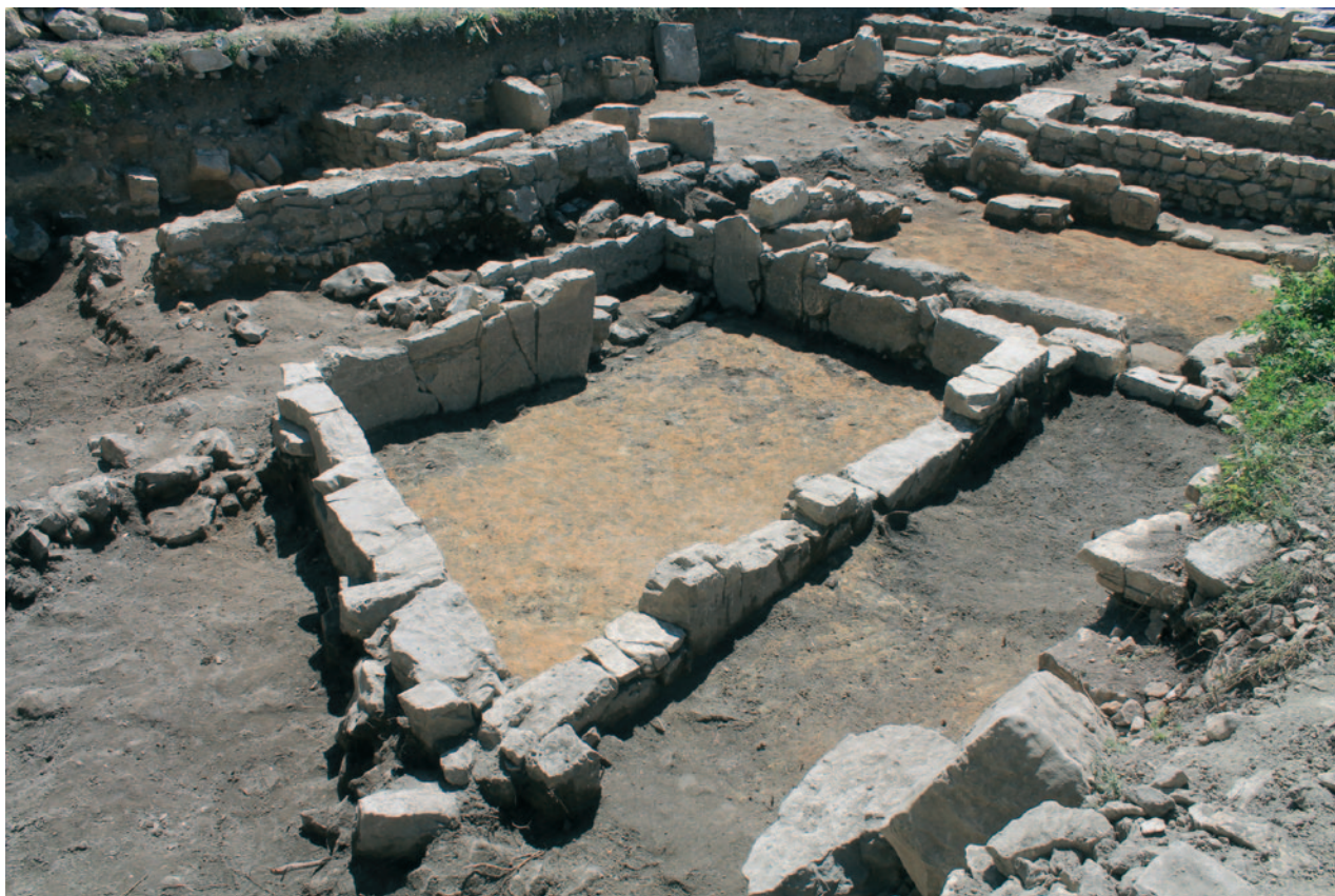
Fig. 5 – Nadin – Gradina, Late Iron Age residential architecture

On the other hand, the example from Kopila, specifically Tomb 4, is also located on the extreme southern edge of Nucleus 1 of the necropolis (Fig. 6). In terms of spatial design, it generally follows other Kopila tombs that persisted from the middle/end of the 4 th century BC to the end of the necropolis in the middle of the 1 st century BC. Nevertheless, it seems that the outer ring (measuring 3,40 x 4,70 m) is more rustic, having been constructed of regular/irregular monumental stone blocks. Also, the central burial placement (1,73 x 1,90 m) is very shallow, which can be traced to its peripheral position and/or later dating (Borzić 2022a: 97).