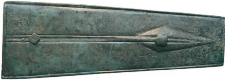
Fig. 13 – Nadin, belt buckle of the Nadin type