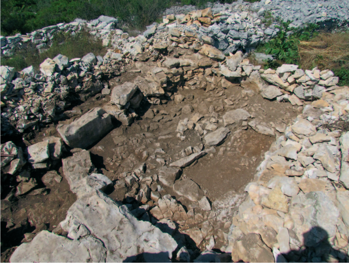
Fig. 6 – Kopila, Tomb 4

In both cases, analysis of the archaeological deposits indicated that the graves were used on multiple occasions. In the case of Kopila, Tomb 4 served as the burial site for a minimum of 32 individuals of both sexes (15 men, 8 women, and 9 inconclusive). All were adults with the exception of one male teenager. 4 Given the excellent state of preservation, we were able to determine that the individuals were buried on their backs with the arms along the body. Women were placed with their heads toward the east and men with their heads toward the west. While pins and weapons (spearheads) were placed only with men, and fibulae and jewellery (earrings and necklaces of glass beads) only with women, pottery goods were placed with both (Fig. 7). Such a principle of "successive" opposite burial is nothing new in the South Dalmatian area because, along with some other tombs from Kopila (Borzić 2022a: 102), it has been recorded at the necropolis of Grebnice near Ukšić since the 7 th century BC (Marijan 2001: 56, 123–130).