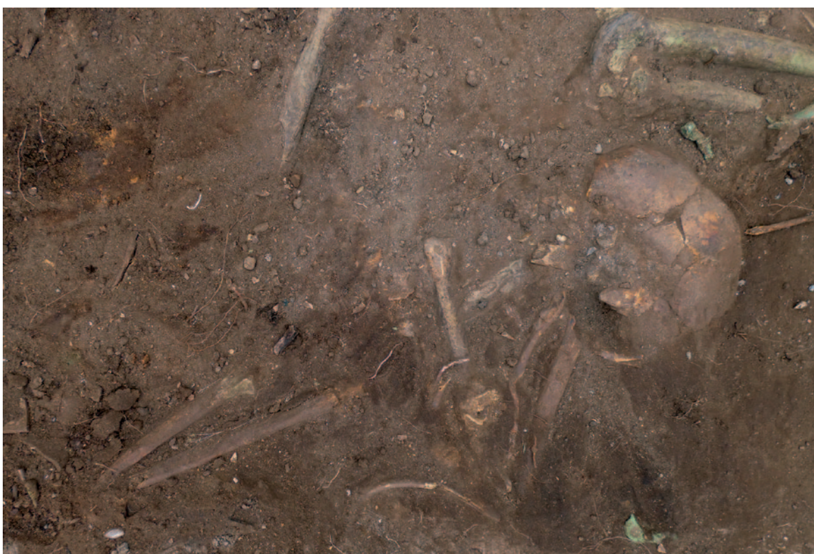
Fig. 8 – Nadin, Tomb 105, individual in crouched position