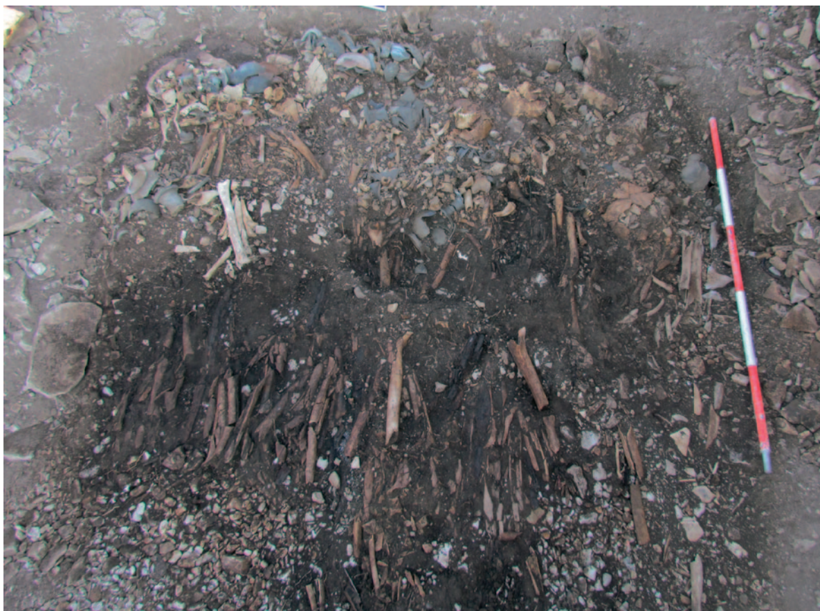
Fig. 7 – Kopila, Tomb 4