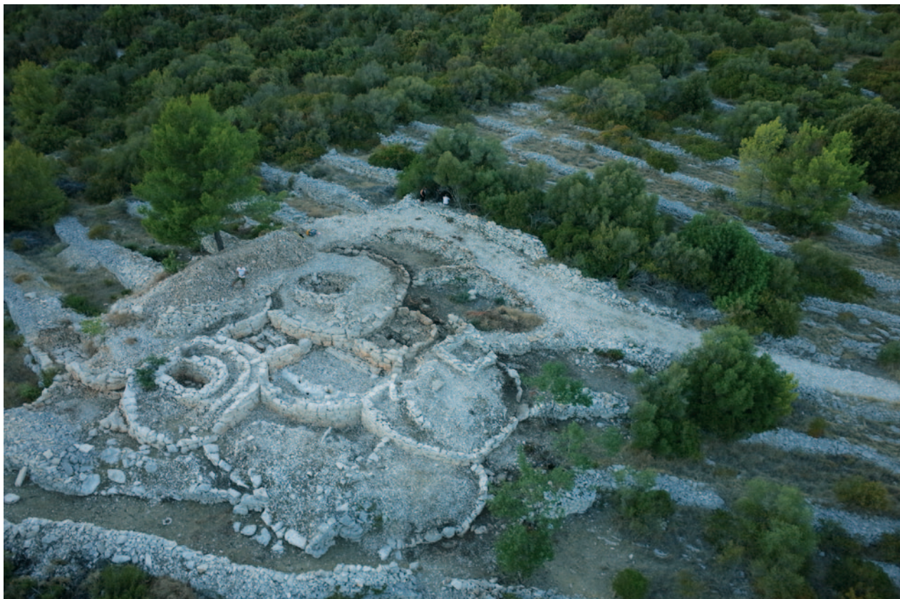
Fig. 3 – Kopila, necropolis

As emphasized earlier, the intent of this work is to compare the funeral customs, and by extension the cultural affiliations, of two important Eastern Adriatic communities in specific moments of protohistory. For this purpose, we have