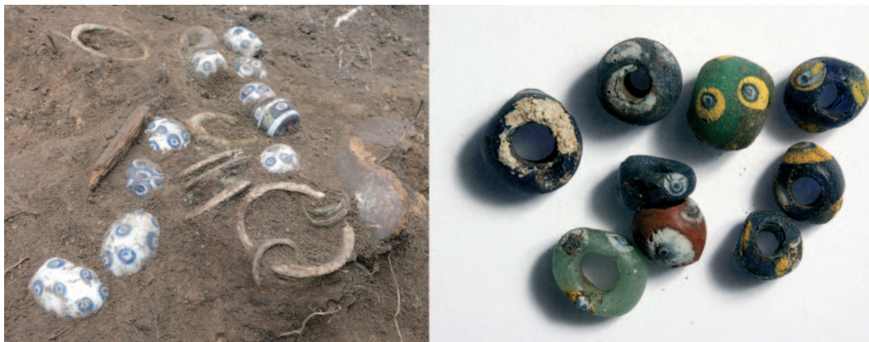
Fig. 16 – Selection of glass eye beads from Nadin, Tomb 105 (left; photo: M. Čelhar), and Kopila, Tomb 4 (right; photo: P. Igljić)

The glass repertoire of Nadin is also characterized by a small number of beads whose production is related to the La Tène, Celtic world (ring beads of the types 23 and 23a after the typology of Haevernick (1960: 69–71; see also: Venclova 1990: 140–141). Their appearance distinguishes the Nadin community not only from the Kopila community, but also from other eastern Adriatic communities, given that such material has not been recorded in that area so far. Their presence, as well as the presence of some belts (an astragal belt segment and a bronze belt characterised by profiled rod-shaped segments; see: Filipović, Mladenović 2017: 164–168; Dizdar 2018: 20–22) characteristic of the La Tène world and hitherto unknown in the eastern Adriatic, confirms the more pronounced (in)direct orientation and connection of the Nadin or North Dal-