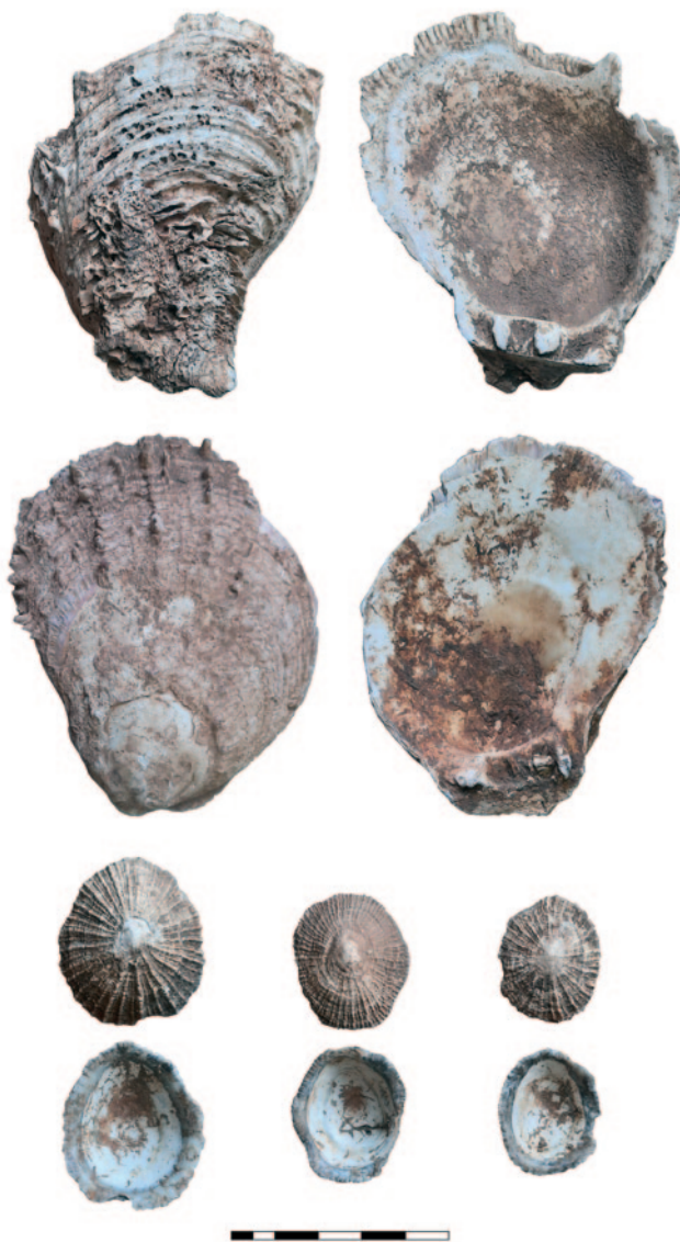
Fig. 3 — Anthropomorphic modifications on spiny oyster Spondylus gaederopus (first row – left valve, second row – right valve) and on limpets Patella sp.

The Greeks, particularly those residing in coastal regions, held the art of fishing in high regard, much like other revered crafts. This sentiment was evident in the presence of professional fishermen (known as halieis , aspalieis ) who supplied local communities with marine products. Alongside various fish species, certain molluscs, especially marine gastropods, were also part of their fishing practices (Lovano 2020). While fishing tools and techniques varied (Theodoropoulou 2011), this article will focus on the tools discovered in Pharos and the corresponding fishing techniques. The primary fishing tools employed were handheld hook and line ( aspalieutike ), with bait consisting of other fish, insects, feathers, as well as marine molluscs (Lovano 2020). The ensuing discussion will delve into the role of molluscs as both bait and intentional and/or unintentional catch during fishing.