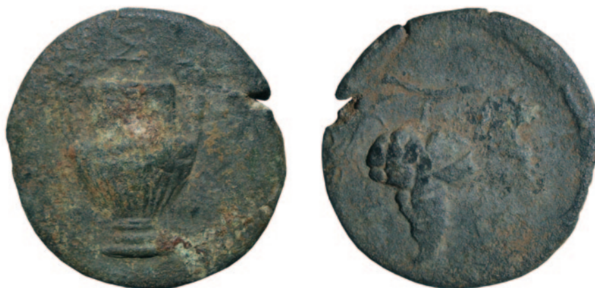
Fig. 5 – Issaeian coin (AE, 19,4 mm, 5.10g, 12 h), volute crater / grape cluster

37–48; cf. Paškvan 2005: 199–206; Ignatiadou 2014; Visonà 2017: 208). The same motifs can be traced on a series of silver and bronze Greek coins from the 5 th c. BCE, such as those from Thebes in Boeotia (Head, Poole 1884 (=BMC Central Greece ), 69, 72, 74, 92, 95, 98, 111–112), Thasos (Poole 1877 (=BMC Tauric Chersonese ), 53–58); Breitenstein, Schwabacher 1943: 1029–1032), or Corcyra (Gardner 1883 (=BMC Thessaly to Aetolia ), 130–131)). The clearly emphasized details of the crater may indicate the existence of an actual object that served as a model. In some details, the depiction of the crater on the Issaeian coin is even similar to the marble craters from Macedonia from the 4 th c. BCE which are characterized by arranged fluting on the body (Ignatiadou 2014: 58, pl. VII). However, like the later representation of the kantharos, the motif of the crater cannot be reliably related to the repertoire of vessels that are known to have been produced by a local Issaeian workshop that likely began working in the mid-3 rd c. BCE (Miše 2013: 126). 6 On the other hand, if we assume that the model was adopted from a similar foreign issue, then the bronzes of Corcyra depicting the volute crater and a bunch of grapes, which belong to the 4 th c. BCE (Gardner 1883 (=BMC Thessaly to Aetolia ), 121; Breitenstein, Schwabacher 1943: 165), represent the closest iconographic parallel. 7