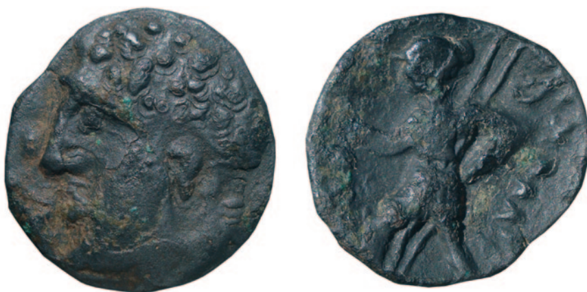
Fig. 3 – Ballaios (AE, 16.7 mm, 3.05g, 5h) – ruler's head left / Artemis left holding two spears (photo: P. Domines Peter)

The state of preservation of the second specimen (AE, 15.9 mm, 1.77g, 9h) is incomparably worse (Fig. 4). The obverse suggests the portrait of a king with a recognizable hairstyle, turned to the right in this case. The reverse depicts Artemis facing left, holding a torch, with her right foot slightly raised. The legend is not legible, but it seems that spears are missing. It is not possible to precisely determine the subtype but it also belongs to the Risan mint (Brunšmid 1998: 90–91, no. 1–6; Marović IIB Risan type (Marović 1988: 84), Ciołek's R. V/4? (Ciołek 2021: 83)).