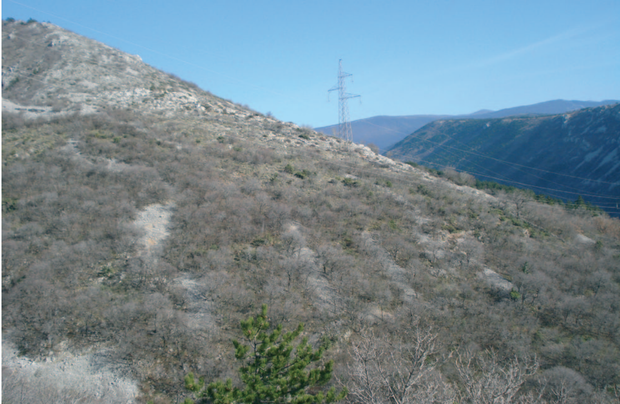
Fig. 1 – Kuk hillfort