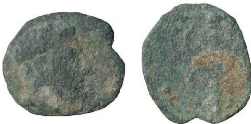
Fig. 4 – Ballaios (AE, 15.9 mm, 1.77g, 9h) – ruler's head right / Artemis left holding a torch