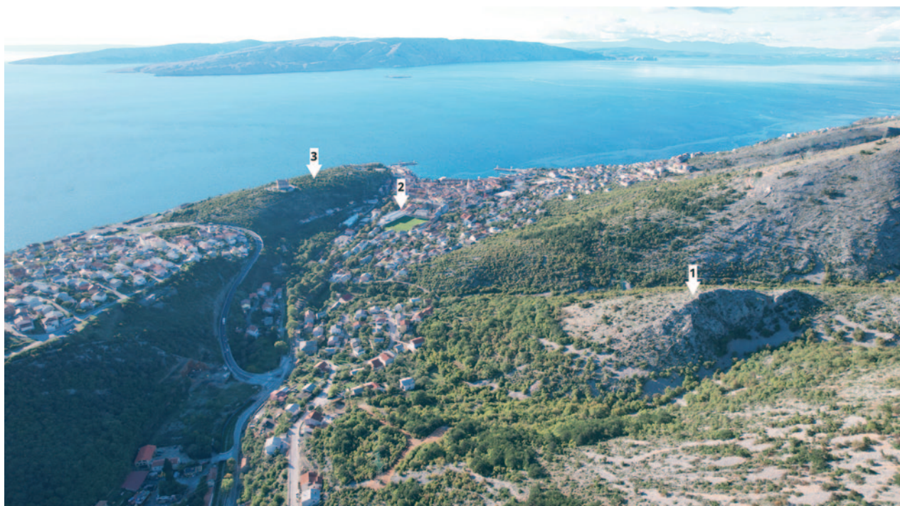
Fig. 2 – Pre-Roman coin findspots in the area of present-day Senj: 1. Kuk hillfort, 2. Štela site, 3. Nehaj hill (photo and modified by: P. Domines Peter)

Based on their stylistic characteristics, two coins from the Kuk hillfort can undoubtedly be attributed to the issue of the Illyrian King Ballaios. Although they significantly differ in terms of preservation, the typical iconography is discernible, featuring a male ruler's head on the obverse and the figure of Artemis with a legend on the reverse. Both specimens are made of a copper alloy and belong to the so-called Risan type (Brunšmid 1998: 90–94; Ciołek 2021: 83).