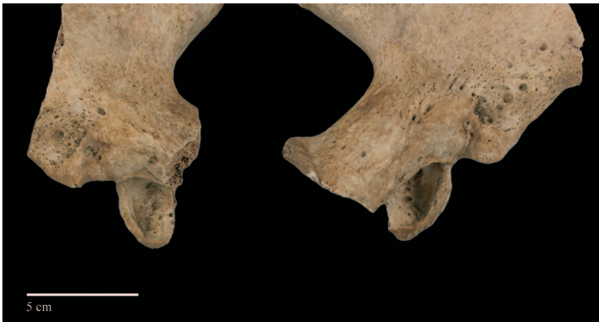
Sl. 5 – Lažni acetabuli na kosturu iz groba 16 Fig. 5 – False acetabula on the skeleton from grave 16

promjera te su plići nego u normalnim slučajevima (sl. 4). Zglobna ploha ( facies lunata ) nije vidljiva, a unutrašnjost je nepravilna te popraćena makroporozitetom i udubljenjima. Na bočnim kostima, prisutne su plitke ovalne udubine nepravilnog i poroznog dna (sl. 5). Na rubovima udubina prisutna je formacija nove kosti u obliku manjih koštanih spikula. Na lijevoj bočnoj kosti udubina se nalazi 22,5 mm superiorno od acetabula, dok se na desnoj nalazi 23,6 mm superiorno od acetabula. Kut velikog sjednog ureza na desnoj kosti zdjelice je povećan, a iznosi 84,5° (sl. 6). Zbog