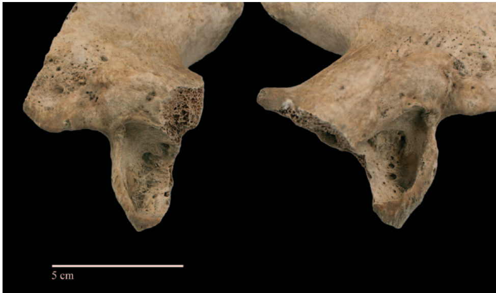
Sl. 4 – Lijevi i desni acetabuli kostura iz groba 16 Fig. 4 – Left and right acetabula on the skeleton from grave 16