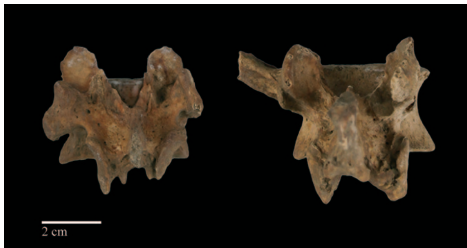
Sl. 3 – Asimetrija zglobnih ploha na prsnom i slabinskom kralješku Fig. 3 – Asymmetric lumbar facets on thoracic and lumbar vertebrae

sakralnog kralješka, a s lijeve strane poprečni nastavak prvog sakralnog kralješka nije spojen s ostatkom križne kosti.