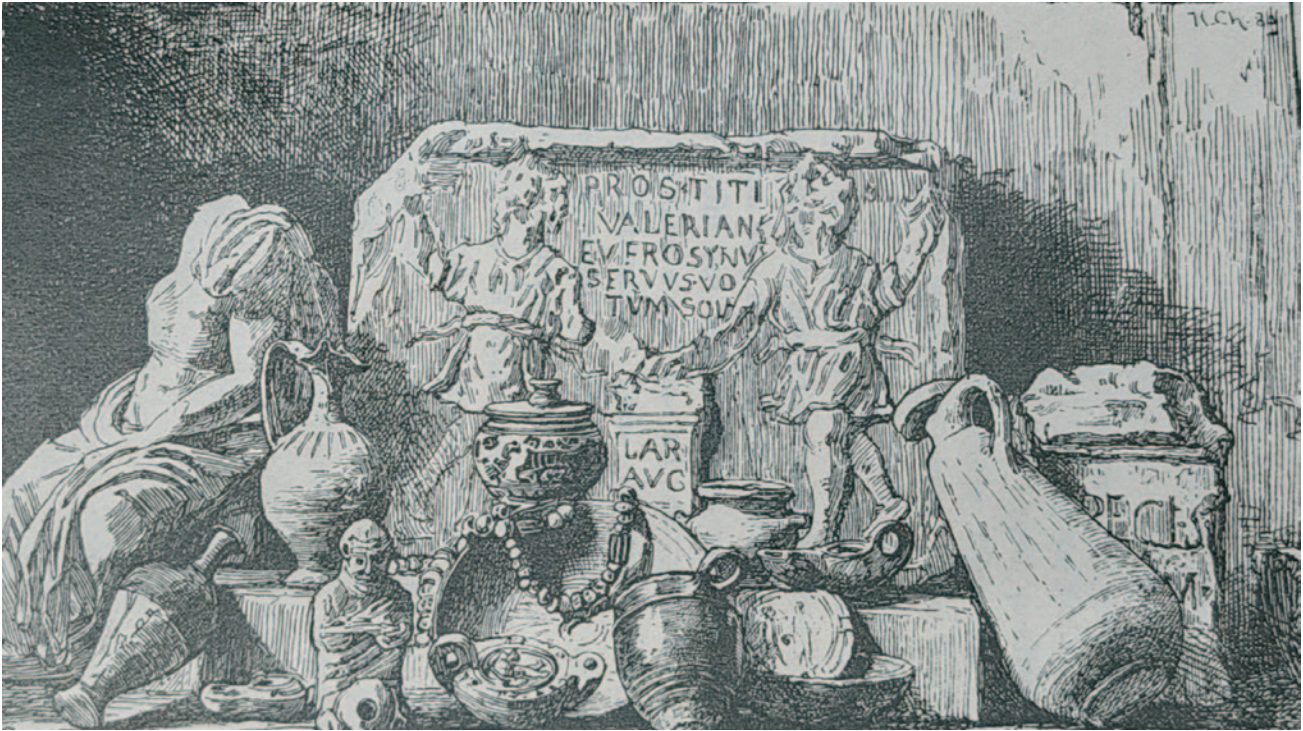
Sl. 4 — Crtež reljefa s prikazom Lara, Salona (Jelić, Bulić, Rutar 1894: T. XV) Fig. 4 — Relief drawing depicting the Lares, Salona (Julić, Bulić, Rutar 1894: Pl. XV)