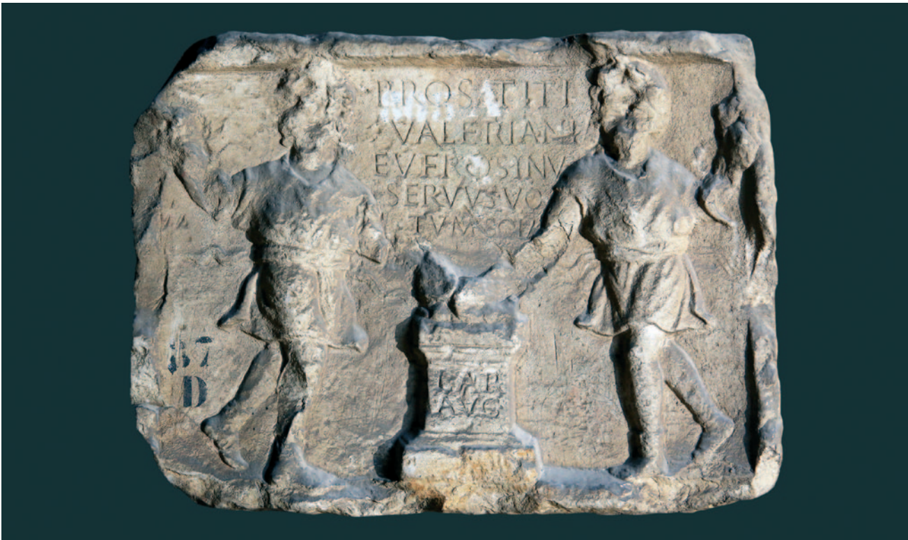
Sl. 5 — Reljef s prikazom Lara, Salona, Arheološki muzej Split, inv. br. A 865, D87, uz dozvolu (snimio: T. Seser) Fig. 5 — Relief depicting the Lares, Salona, Archaeological Museum Split, inv. no. A 865, D87, with permission (photo by: T. Seser)