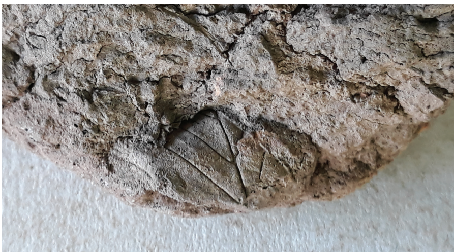
Fig. 2. Impression of a leaf fragment preserved in the remains of a furnace for smelting iron ore dating to Late Antiquity.

During the archaeological excavations of the multi-strata site of Virje-Sušine in 2013, in Trench 7, along with the remains of a furnace for smelting iron ore, part of a workshop was also investigated where smelting waste had been deposited, which consisted of a large quantity of smelting slag, broken pieces of the furnace walls, and fragments of pottery nozzles (Sekelj Ivančan 2014b). The remains of the discarded material included a piece of furnace wall with a negative impression of a leaf. In order to determine the period when the waste was discarded, and hence also when the smelting workshop was in operation, a sample of charcoal gathered from the same