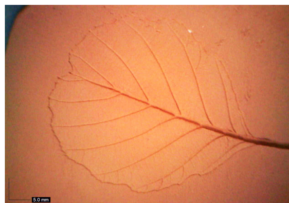
Fig. 3. Impressions of recent leaves of a) European hornbeam ( Carpinus betulus ), b) wild cherry ( Prunus avium ), and c) black alder ( Alnus glutinosa ) on fired clay.

negative of the leaf has relatively small dimensions for the species to which it belongs, which might indicate a young springtime leaf. However, plants can produce new leaves on their outer branches throughout the growing season, from spring to late summer.