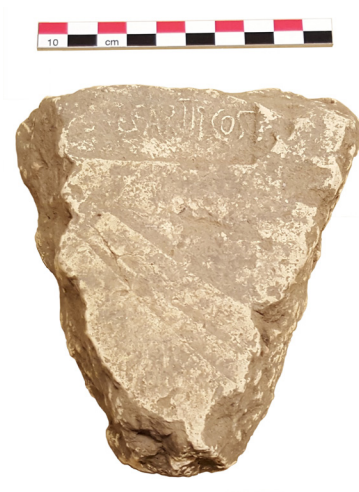
Fig. 5. Stamp CAESAR III COS from Caska (Cissa).