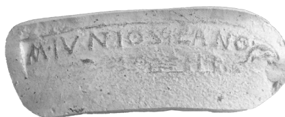
Fig. 6. Stamp M. IVNIO SILANO from Caska (Cissa) and its calque (made by N. Lete/Gearheo d.o.o).