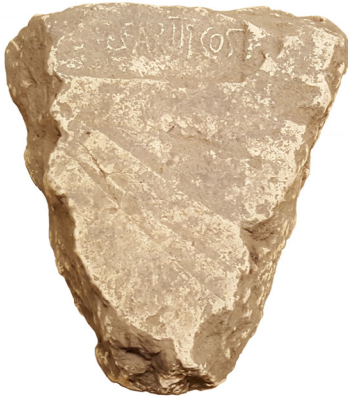
Fig. 5. Stamp CAESAR III COS from Caska (Cissa).