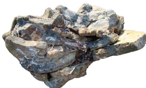
Fig. 4. Wasters from the Plemić Bay.