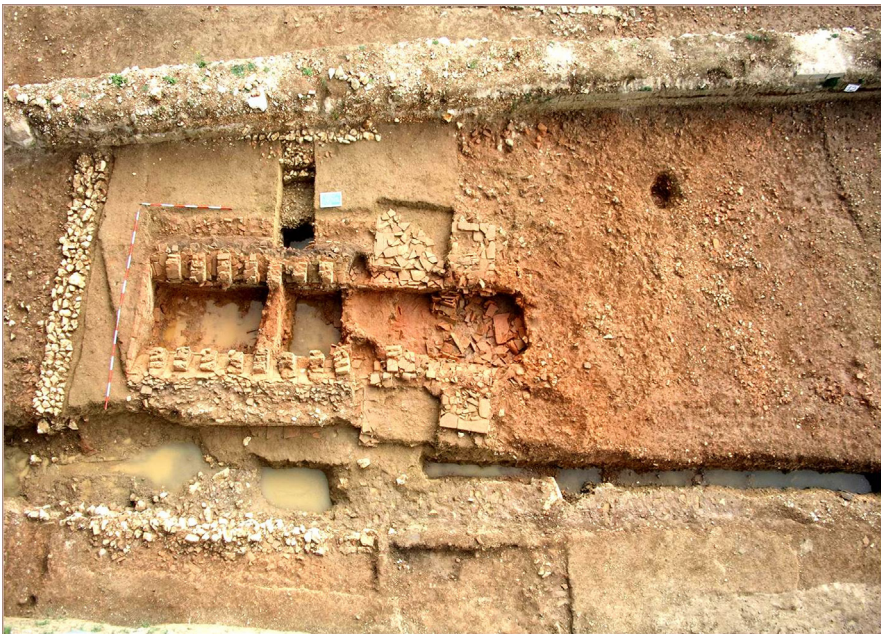
Fig. 1. A kiln from Crikvenica workshop.