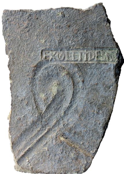
Fig. 3. Tile with a Plemić Bay production stamp EX OF L. TETTI DE. ZEDES.