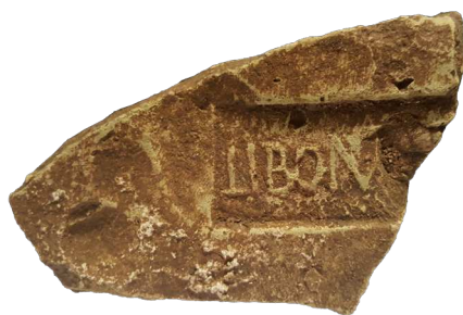
Fig. 7. Stamp LIBON[---] from Caska (Cissa).