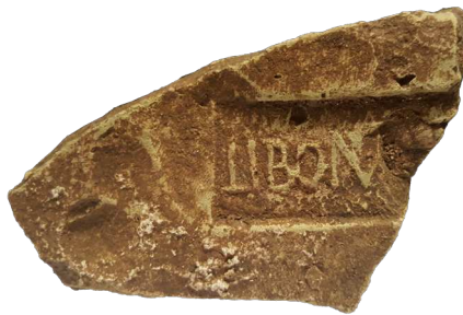
Fig. 7. Stamp LIBON[---] from Caska (Cissa).