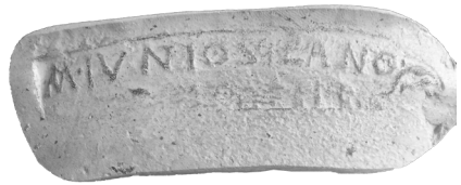
Fig. 6. Stamp M. IVNIO SILANO from Caska (Cissa) (photo by T. Seguin/CC/Cissa Antiqua 2015) and its calque (made by N. Lete/Gearheo d.o.o, courtesy of N. Lete).