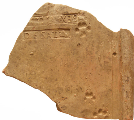
Fig. 2. Tile with a Crikvenica production stamp DE SALT SEX MTLI MAX.

Very confined distribution of locally produced ceramic goods indicates that they were mostly intended to either satisfy the needs of the estate and/or for local markets 16 , and not for a trade with more distant areas. Nevertheless, recent finds of Crikvenica produced amphorae at Aquileia (Canale Anfora site) 17 do indicate that, perhaps sporadic and indirect, commerce outside of the Liburnian region should not be a priori excluded.