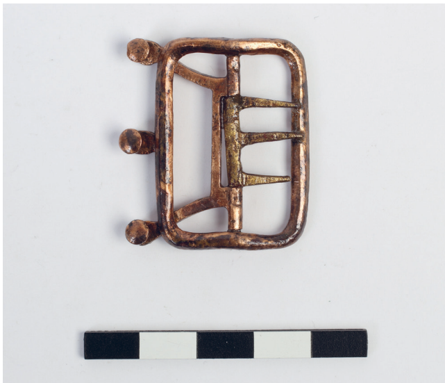
SLIKA 5. Kopča za ovratnik pronađena sa stražnje strane vrata pokojnika iz groba 253.