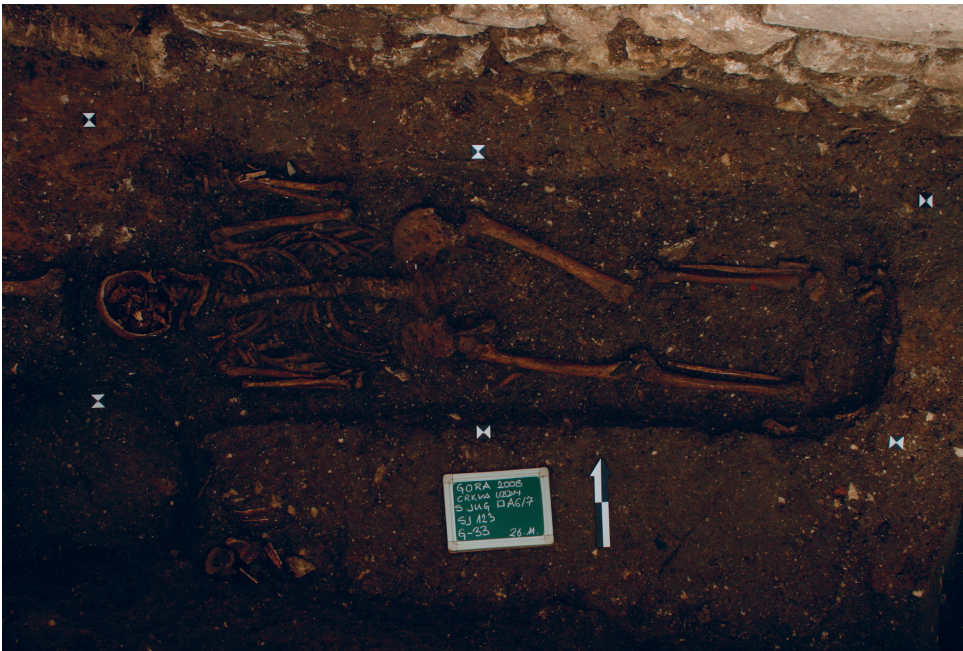
SLIKA 2. Kostur iz groba 33.