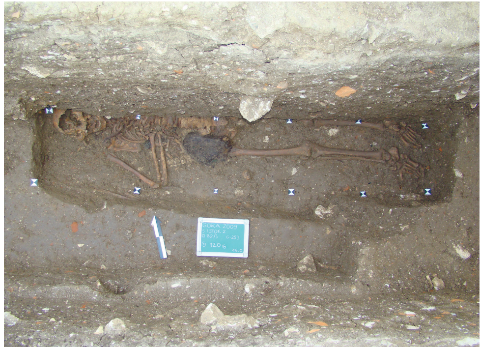
FIGURE 3. Partially-excavated skeleton from grave 253.

Irene Mittermeier primjećuje da se takvi primjerci zrna, oblika dvostruke lubanje, pojavljuju većinom uz caravaca križeve te ih datira u 17. stoljeće. 81 Darko Knez pak smatra da se krunice sa zrnima u obliku lubanje proizvode tek od 18. stoljeća. 82 Osim dvostrukih, u Njemačkoj postoje i memento mori zrna oblika trostruke lubanje, na kojima se uz Kristovu glavu i mrtvačku lubanju pojavljuje i glava nekog smrtnika, najčešće pape ili cara, a radi se o personifikaciji smrti, odnosno o upozorenju da je sve ljudsko prolazno. 83 Memento mori zrna uobičajeno su dijelovi manjih krunica, tzv. cenera ili većih, tzv. arma Christi krunica, koje, među ostalima, imaju i zrna što simboliziraju oruđa Kristove muke, 84 dok su, primjerice, u novovjekovnoj Poljskoj memento mori zrna na drvenim krunicama nosili članovi bratovštine „dobre smrti”. 85 Zrno u obliku lubanje, pronađeno u Vinkovcima, moglo bi biti dijelom cenera jer je, osim njega, pronađeno još