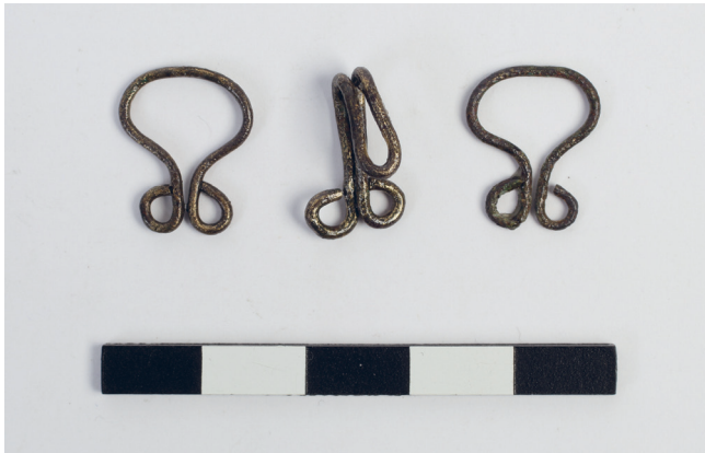
SLIKA 4. Dvopetljaste kopčice pronađene u blizini zgloba pokojnika iz groba 253.

FIGURE 4. Two-part double-looped clasps discovered near the wrist of the deceased individual in grave 253.