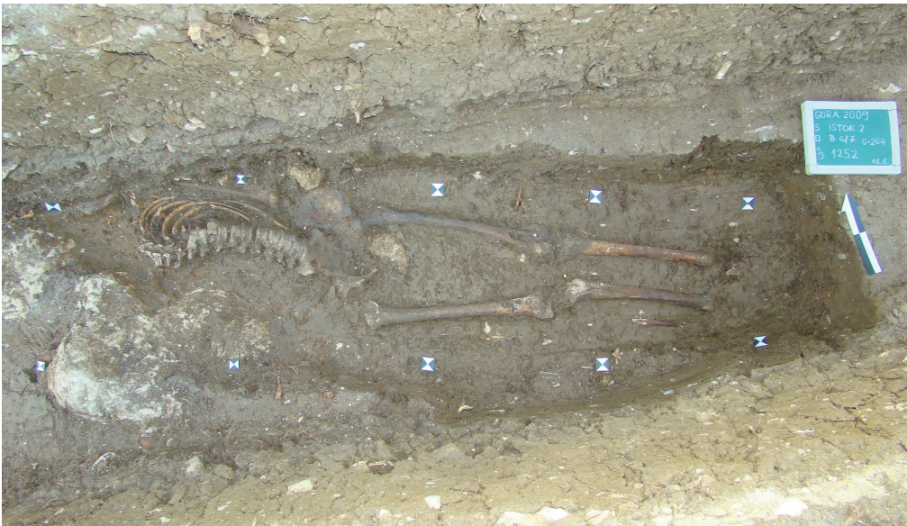
SLIKA 6. Kostur iz groba 264 (Arhiva Instituta za arheologiju).