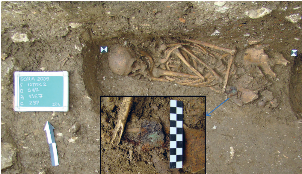
SLIKA 7. Kostur iz groba 297 i detalj ostataka brevara in situ.