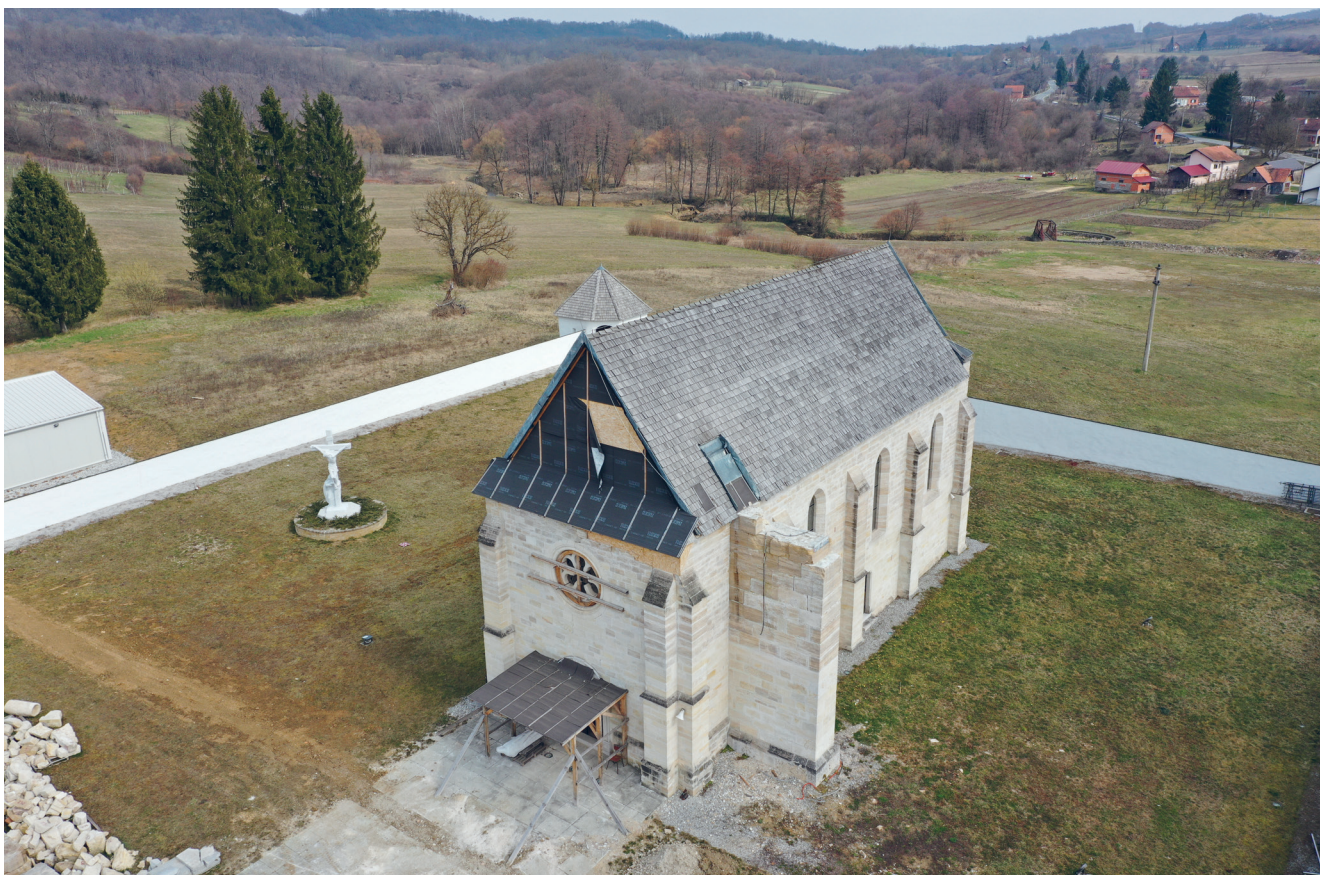
SLIKA 1. Pogled iz zraka na današnje stanje crkve.