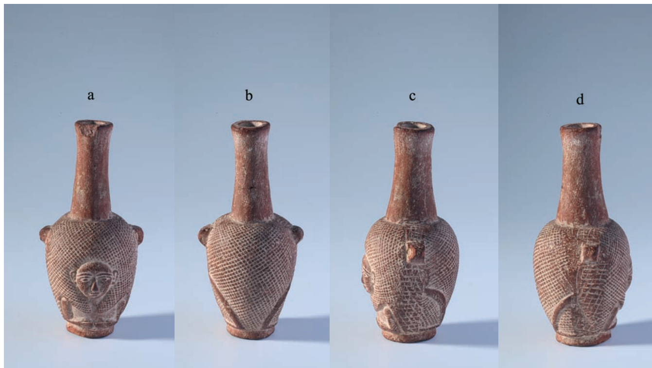
Sl. 3 Mala boca od pečene zemlje, inv. br. ATM 233 (Muzej Mimara, Zagreb): a. prednja strana, b. stražnja strana, c. lijeva strana, d. desna strana

The upper part of this unusual vessel is elongated and narrow; from the middle section of the lower part it gradually widens and then again gradually narrows down until the bottom of the vessel. The small handles are visible on either side of the vessel. The entire lower part is ornamented with a thin "web-like" pattern. The middle section of the potbellied lower part is decorated with an unidentified figure in squat position with marked eyes and big ears. Near the bottom two arms with hands are also visible at the