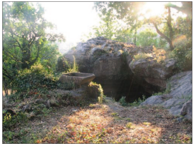
Sl. 4 Svetište Mitre i Silvana, Močići

Važno je naglasiti da je još nekoliko komada reljefa pronađeno na istom nalazištu Putovići Ograja, koji također