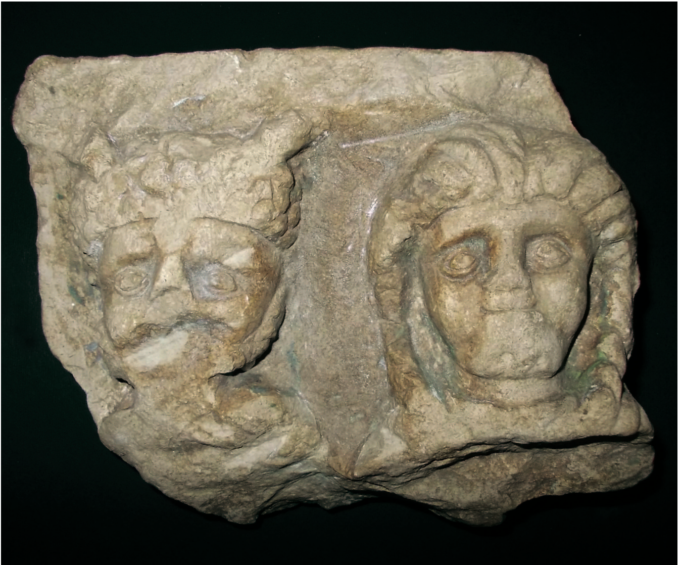
Sl. 3 Reljef s prikazom Silvana i Dijane, Zenica Fig. 3 Relief depicting Silvanus and Diana, Zenica

Pojednostavljenje oblika dovelo je do dominacije velikih, okruglih očiju kojima su pridodani plastično izbočeni profil i lice. S obzirom na glavne značajke spomenika, naglašene u ukočenom izrazu lica i jednako ukočenom pogledu moguće je pomaknuti datiranje reljefa do u rano 4. stoljeće.