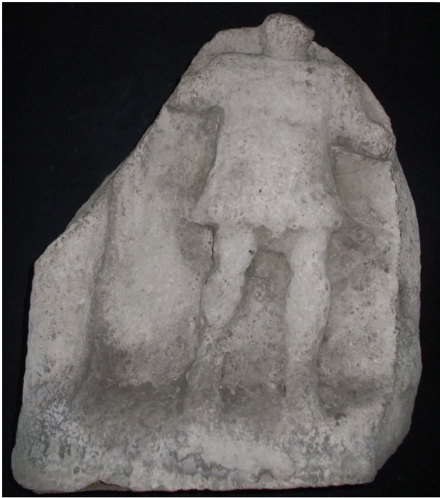
Sl. 5 Reljef s prikazom Silvana pronađen u Ograji, Putovići Fig. 5 Relief depicting Silvanus, found in Ograji, Putovići

prikazuju Silvana i/ili Dijanu (sl. 5–7). Ovi drugi ulomci spomenika s prikazom bogova s istog nalazišta prikazuju nam boga kojeg smo vidjeli na većini spomenika iz Dalmacije. Na osnovi te činjenice, sasvim je opravdano pretpostaviti da je ovo nalazište bilo Silvanovo (i Dijanino) svetište.