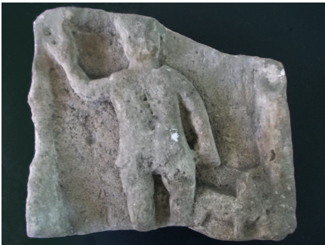
Sl. 7 Reljef s prikazom Silvana pronađen u Ograji, Putovići