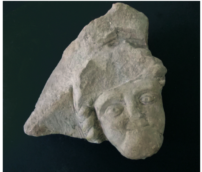
Sl. 6 Reljef s prikazom Dijane pronađen u Ograji, Putovići Fig. 6 Relief depicting Silvanus, found in Ograji, Putovići

Za kraj ove rasprave možemo zaključiti da smo kroz tekst vidjeli tri različite razine sinkretizma (prihvatimo li predloženo tumačenje zeničkog spomenika), i to u tri, kako se čini, donekle različita tipa svetišta. Vrlo je opravdano zaključiti kako spajanje ovih elemenata nije bilo rezultat kolektivne kognitivne promjene nego prije svega osobne. Ponekad nas mogu zvesti naše tradicionalne pretpostavke o pojavnim oblicima pojedinih kultova. Prema riječima S. Pricea, navikli