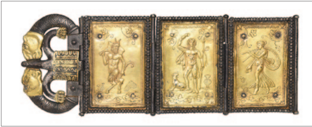
Fig. 2 The “London” belt-buckle (after: https://www.timelineauctions.com/lot/military-parade-buckle-with-gods/71881/ )

Sl. 2 „Londonska“ pojasna kopča (prema: https://www.timelineauctions.com/lot/military-parade-buckle-with-gods/71881/ ).