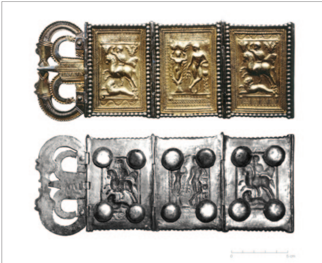
Fig. 3 The luxurious silver gilt belt buckle from "Asia Minor" (after: Feugère 1992: Fig. 3: 2; Pl 1; Artefacts.mom.fr: PLB-4012)

Sl. 3 Raskošna pozlaćena srebrna pojasna kopča iz „Male Azije“ (prema: Feugère 1992: sl. 3: 2; tab. 1; Artefacts.mom.fr: PLB-4012)